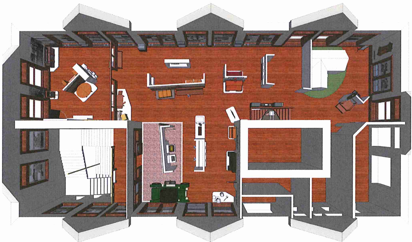
Third Floor, overview