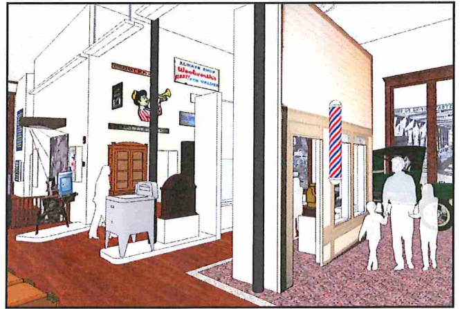
Third Floor, looking northwest

The exhibit will utilize historic artifacts, photos and documents to highlight the people, causes, and events that shaped our communities. Exhibit storylines will feature native populations, early settlers, business leaders, activists, educators, athletes, philanthropists, and immigrants. Displays will allow visitors to experience the past and learn how it influences who we are today. Interactive elements will draw visitors back in time and give them an opportunity to reflect on today's issues. A family education center will help children and parents understand how things used by earlier generations reveal what life was like in the past.