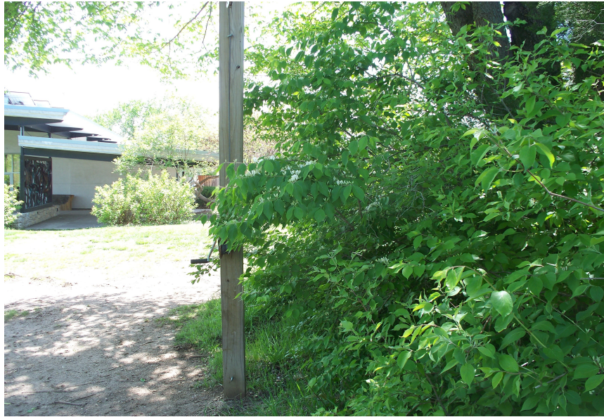
Prairie Park Nature Center