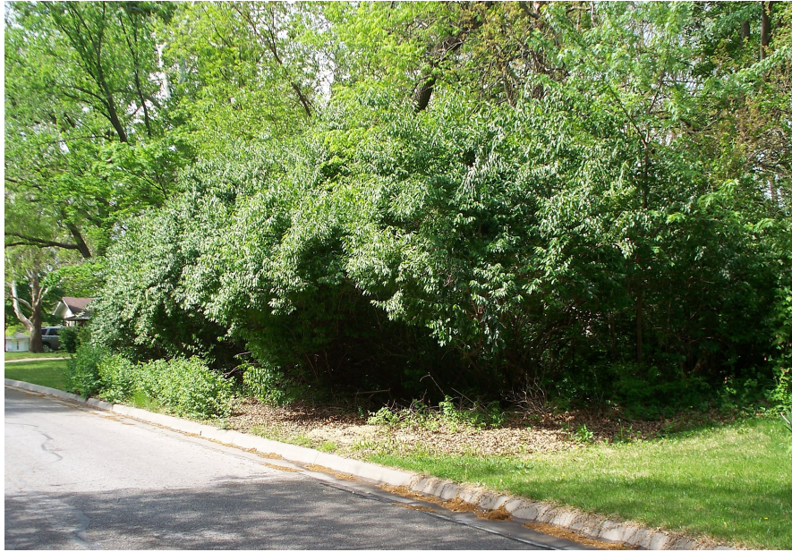
Rockledge at 9th Terr.