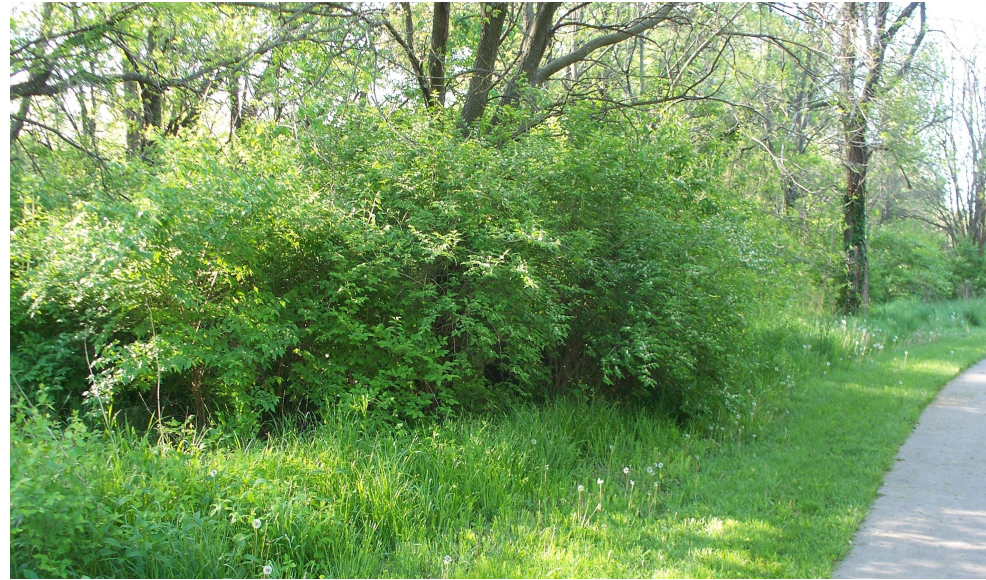
Naismith Valley Park