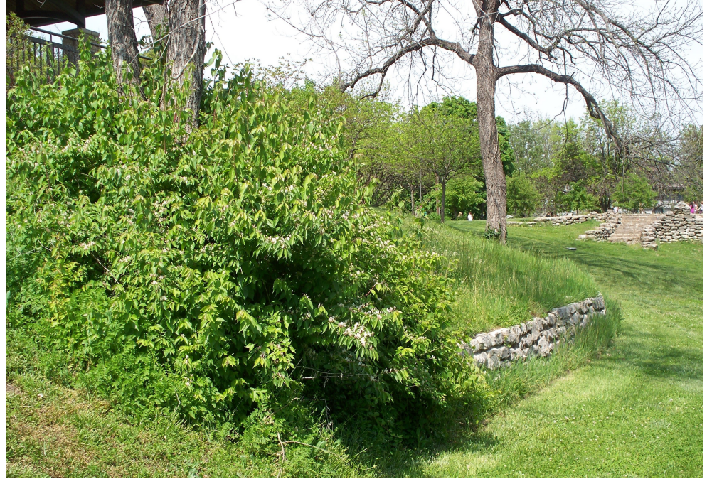
Clinton (Pinckney) Park