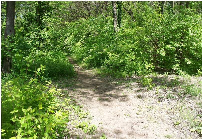
Brook Creek Woods