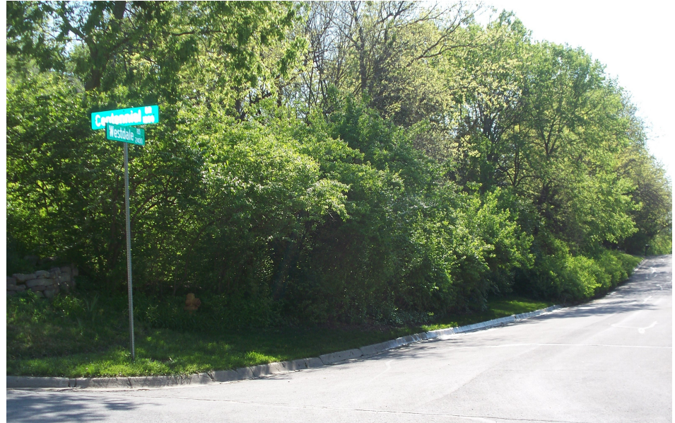
Westdale at Centennial