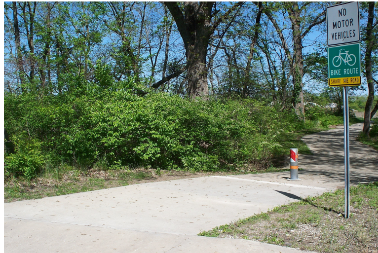
SLT Trail at Kasold