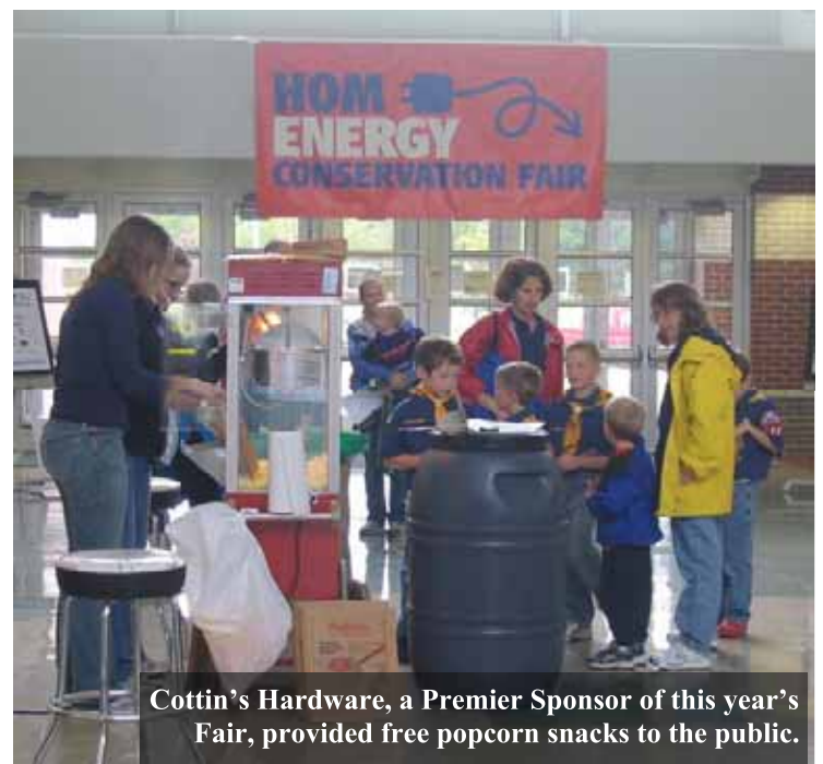
Cottin's Hardware, a Premier Sponsor of this year's Fair, provided free popcorn snacks to the public.