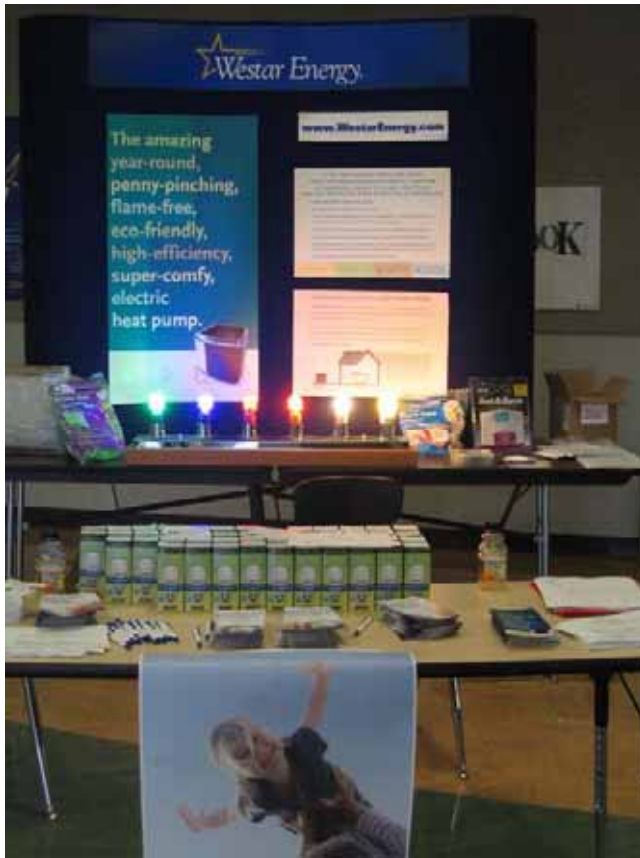
Westar Energy attended to promote the "ENERGY STAR Change a Light Pledge", and gave away free compact fluorescent bulbs all day to attendees.