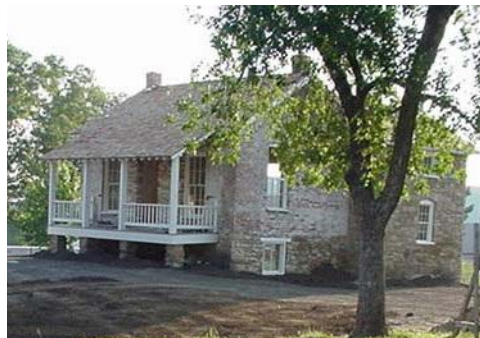
Historic Antebellum Murphy-Bromelsick House

The Lawrence and Douglas County communities wish to express our appreciation for the efforts of our Congressional delegation which recently resulted in the passage of legislation obtaining federal designation as a National Heritage Area. This designation will provide educational and cultural opportunities that capture and preserve the history of the area and focus attention on the role the region has played in the nation's struggle for freedom and opportunity for all of its people.