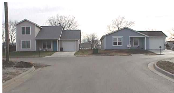
Atherton Court homes built by Tenants to Homeowners and Habitat for Humanity through funds provided by CDBG and HOME programs.

For fiscal year 2006, the City of Lawrence CDBG allocation was $816,981 and for HOME, $645,694. Although HOME funds have remained relatively steady (only 1.2% decrease since 2004), the CDBG allocation has experienced a 13.8% decrease since the 2001 allocation. The City of Lawrence uses CDBG and HOME funding for various community wide activities including a highly successful comprehensive housing rehabilitation program, first time homebuyer, emergency, energy efficiency, and weatherization programs – all for low and moderate income owner/occupants, funding of neighborhood associations in target neighborhoods, target neighborhood capital improvement projects, as well as funding for public service agencies helping the homeless and other low and moderate income persons in the community. As the City awaits the outcome of the 2007 funding allocation, we oppose efforts for any further cuts to these allocations.