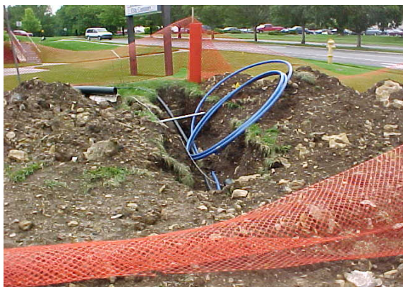
Lawrence must be able to regulate utilities that use public right-of-way.

Recent proposed legislation would strip the ability of local communities to regulate the use of their local right-of-way by telecommunications companies. We urge our federal legislators to recognize the recent changes made by the Kansas legislature on this topic removing the need for federal legislation for Kansas companies and consumers. Kansas cities must continue to receive appropriate compensation for the use of their public right-of-way and must continue to be able to regulate the use of public right-of-way.