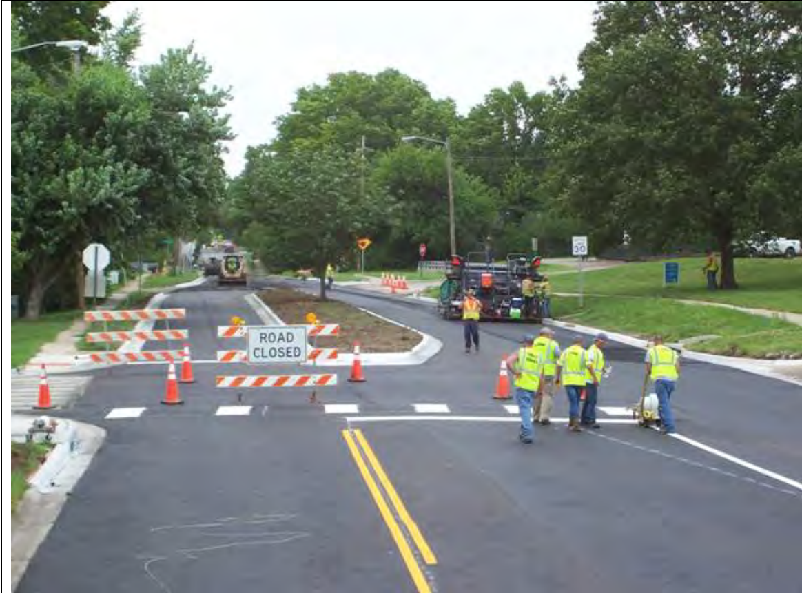
Northbound Louisiana Street in front of Broken Arrow Elementary School.

Louisiana Street was milled and overlaid along with curb and gutter replacement from W. 27th Street to Broken Arrow Park. The project was completed and opened to traffic on August 18th. Other enhancements include a new pavement marking layout to improve turning movements and also added bicycle sharrows.