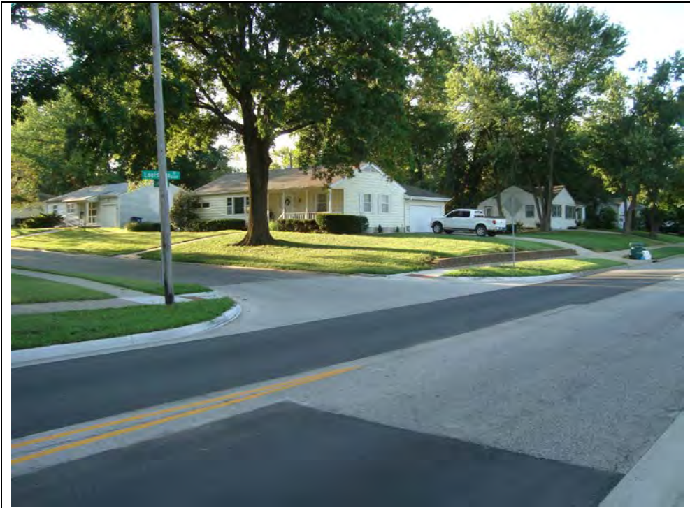
Louisiana Street & Dakota Street facing east.