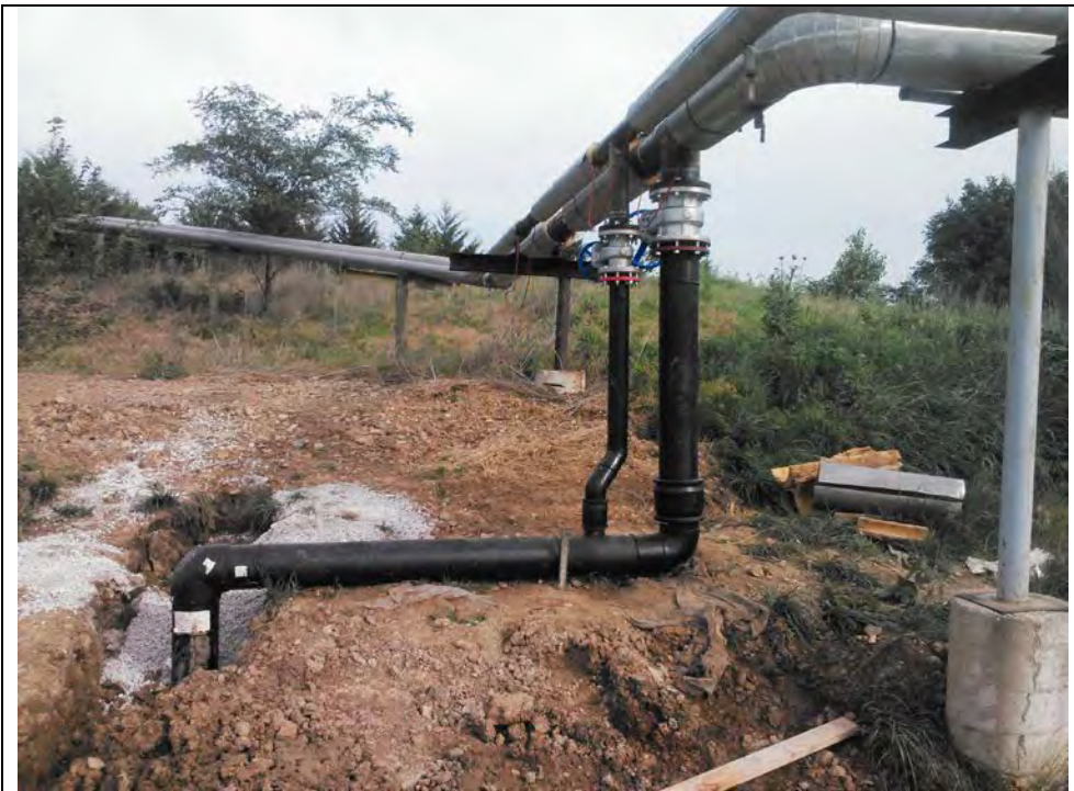
Interceptor Trench Direct Connection at Venture Park.