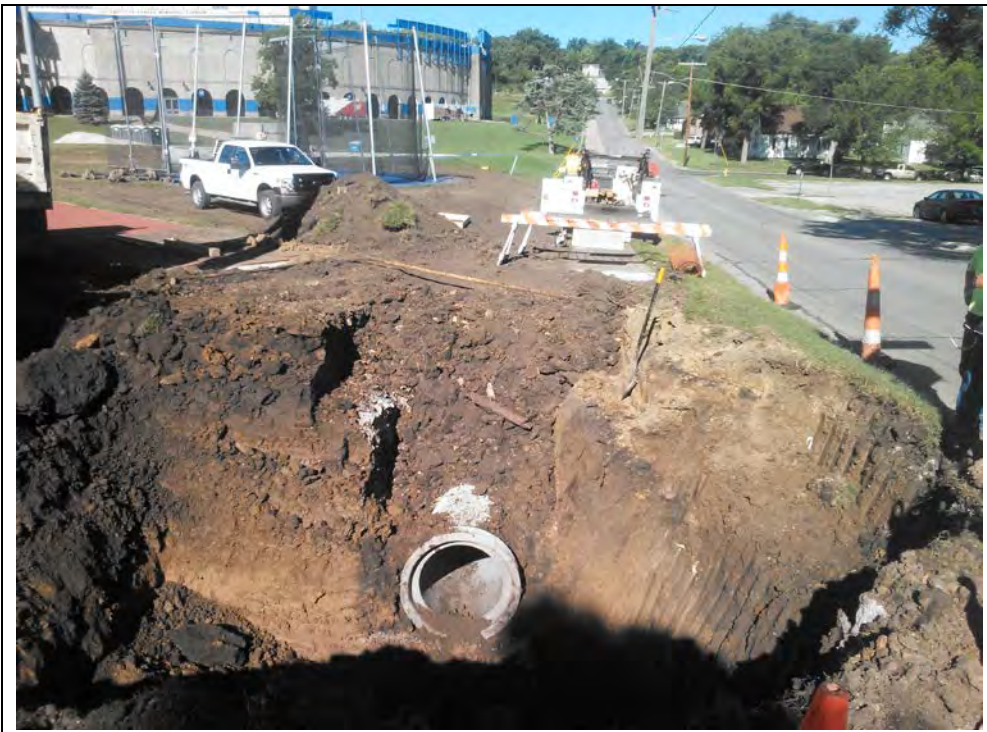
Southeast corner of Fambrough & Mississippi Streets facing westbound.