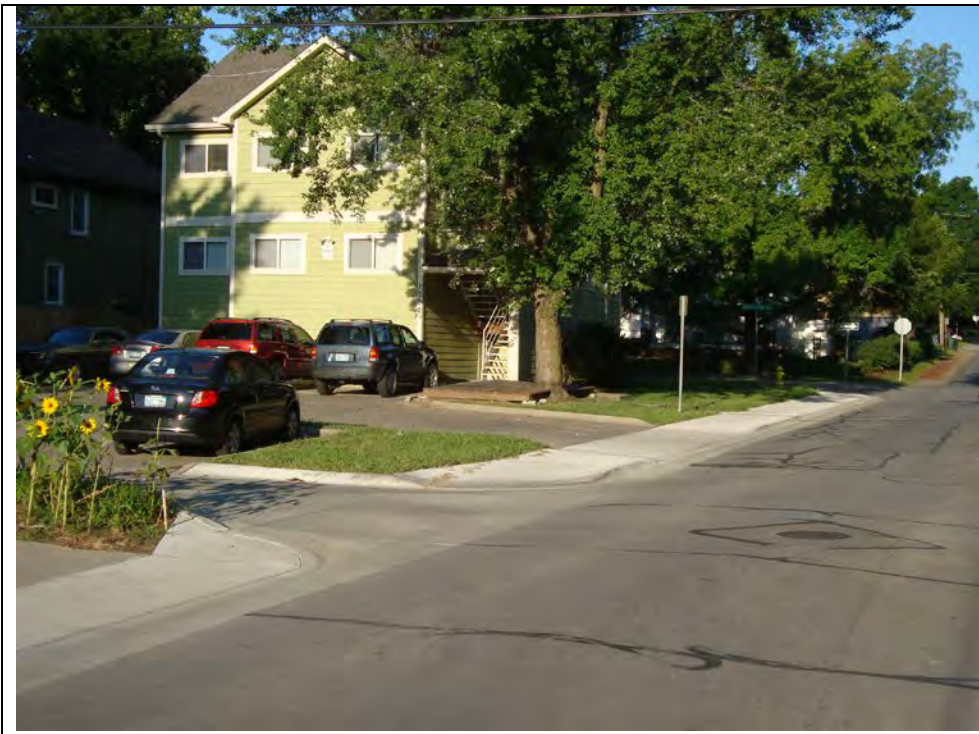
Curb and Sidewalk on 17th Street east of Kentucky street.