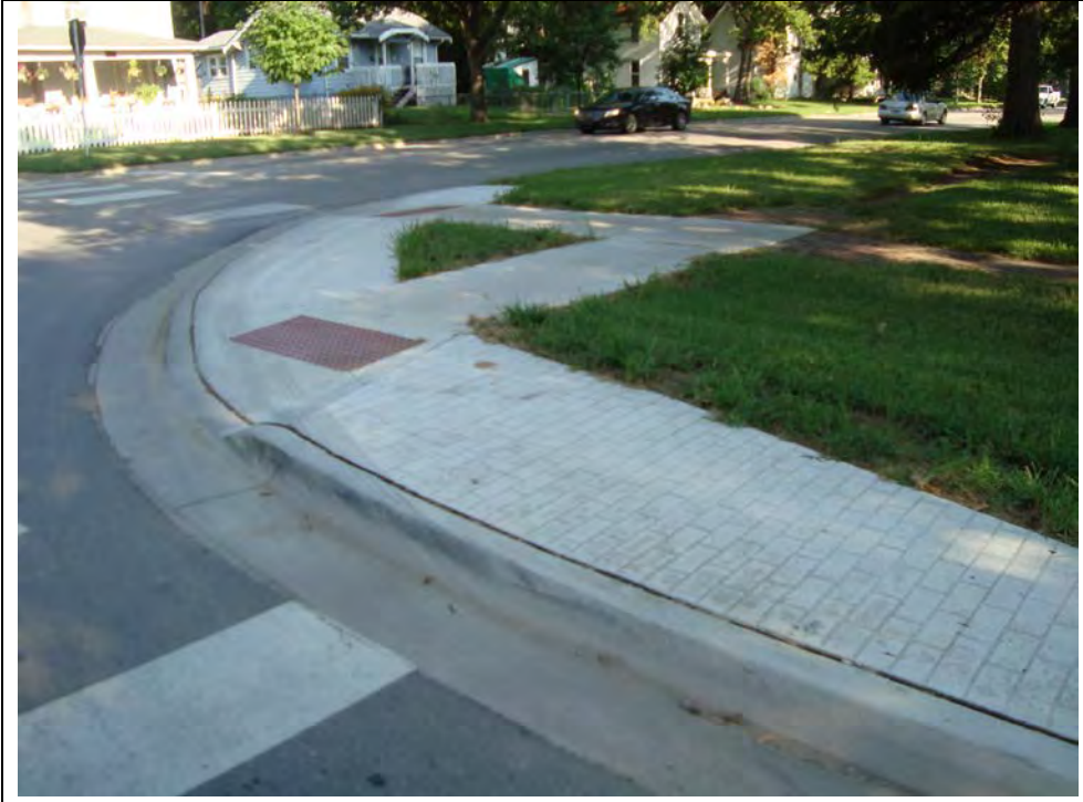
Northeast corner of 11th & Connecticut Street.