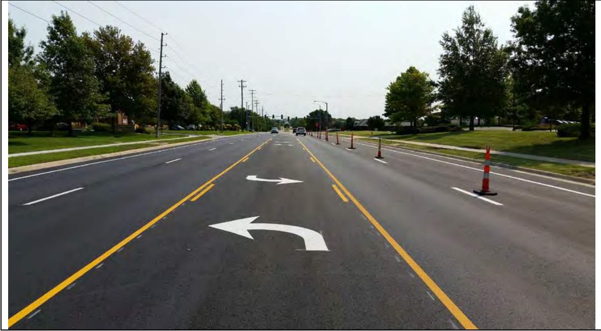
Eastbound Bob Billings Parkway west of Wakarusa Street intersection.

This project included widening of Bob Billings Parkway to allow for construction of a dedicated left turn lane on Bob Billings into Corpus Christi Church. The area between this project and the PW1316 project at George Williams Way was also milled and overlaid and had new pavement markings installed to include a center left turn lane on Bob Billings. Bike lanes and new sidewalk was also constructed on both sides of the roadway. Construction Began May 25, 2015 and the project was completed August 27, 2015.