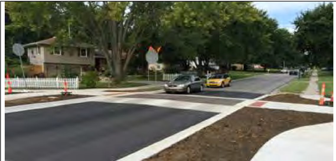
Westbound 27th Street at Naismith Valley Trail Crossing.

A sidewalk was installed on the north side of 27th Street from Belle Haven Drive to Naismith Valley Park. A raised crosswalk was also installed at the Naismith Valley Trail crossing on 27th Street. Both of these projects were completed on time before the first day of school for the Lawrence School District. In addition to the raised crosswalk, a pedestrian hybrid beacon will also be installed at the trail crossing when the poles are delivered by the manufacturer this fall.