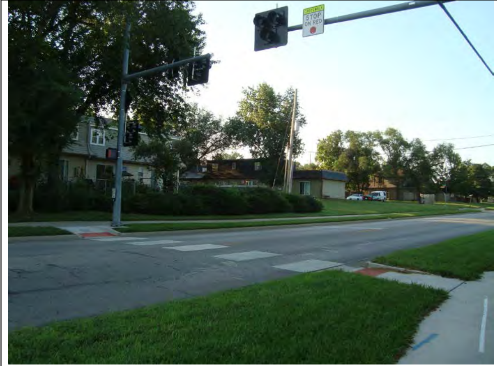
Haskell Avenue south of 20th Street. Installed Hawk Beacon and sidewalk ramps.