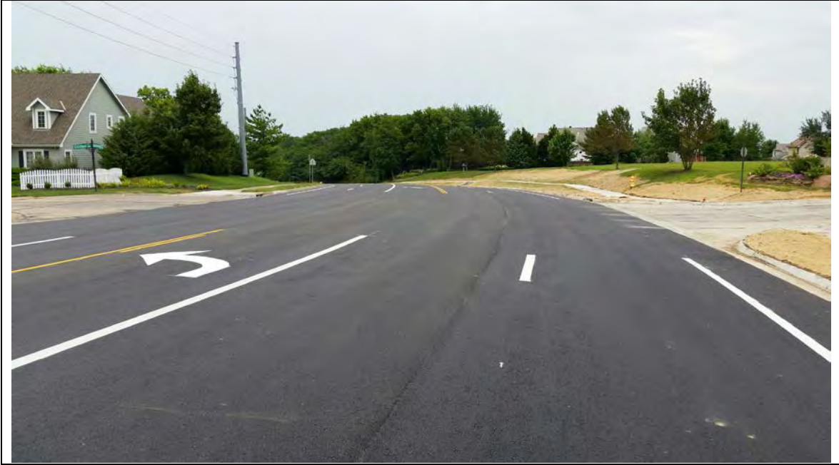
Eastbound Bob Billings Parkway @ Corpus Christi Church Driveway & Goldleaf Place.

This project included the full reconstruction of Bob Billings Parkway between Foxfire Drive and Wakarusa Drive with full depth pavement repair and underdrains installed. The median was removed through most of the corridor to allow for left turn lanes to be striped. New sidewalk and ramps were constructed on both the north and south sides of the roadway as well as some curb and driveway gutter improvements in areas that were needed. Also, fiber conduit for the city was installed on the south side of the roadway for future use. Construction Began May 18, 2015 and the project was completed August 17, 2015.