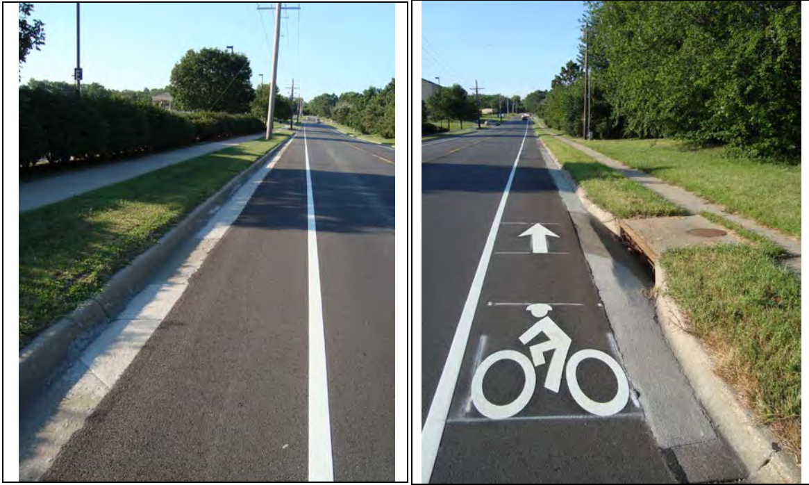
Southbound N. Iowa Street north of W. 2nd Street.