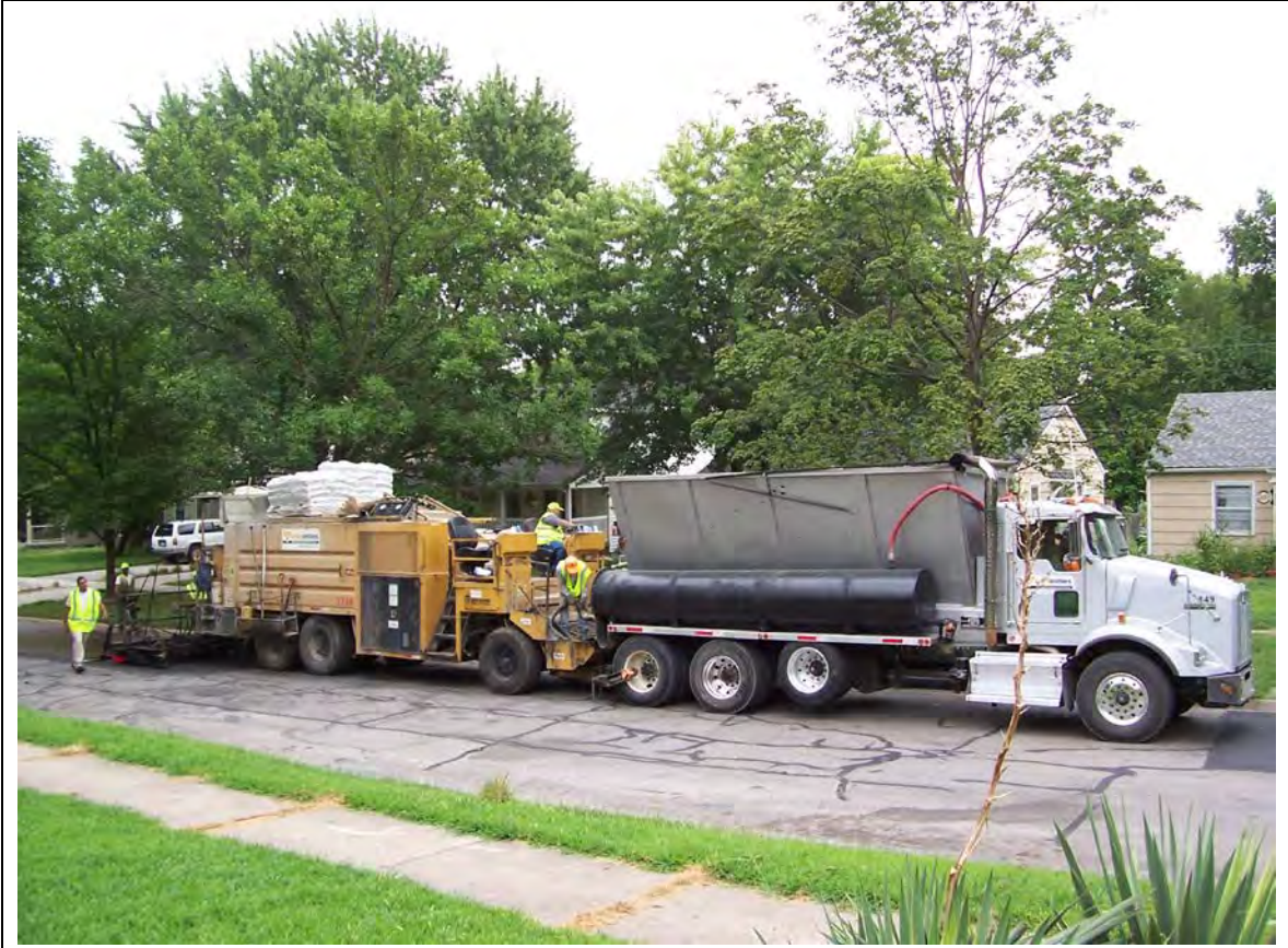
Construction crews in the middle of microsurfacing process.

The project began in early May and was completed on August 17, 2015. The patching and microsurfacing portion of the project included a number of City residential and collector streets generally bordered by W 6 th St. to KU and Iowa St to Illinois St. The arterial N. Iowa St. from Peterson Dr. to Lakeview Rd. was also included for microsurfacing. Streets included for patching and microsurfacing were determined to be in a generally good condition. These streets were included with the microsurfacing planned process as a preventative maintenance work activity to preserve the streets while also addressing some structural deficiencies to prolong pavement life cycle and effectively sustain the infrastructure assets. Streets deteriorated beyond the recommended condition for microsurfacing and included with this project had milling and overlay work performed, such as W 11 th St from Connecticut St to Delaware St and N Iowa St from Princeton Blvd to Peterson Rd. Additional bicycle pavement markings (sharrows and bike lanes) have been included on several streets within the project work areas as coordinated by the Public Works Department based on recommendations from Bicycle Advisory Committee.