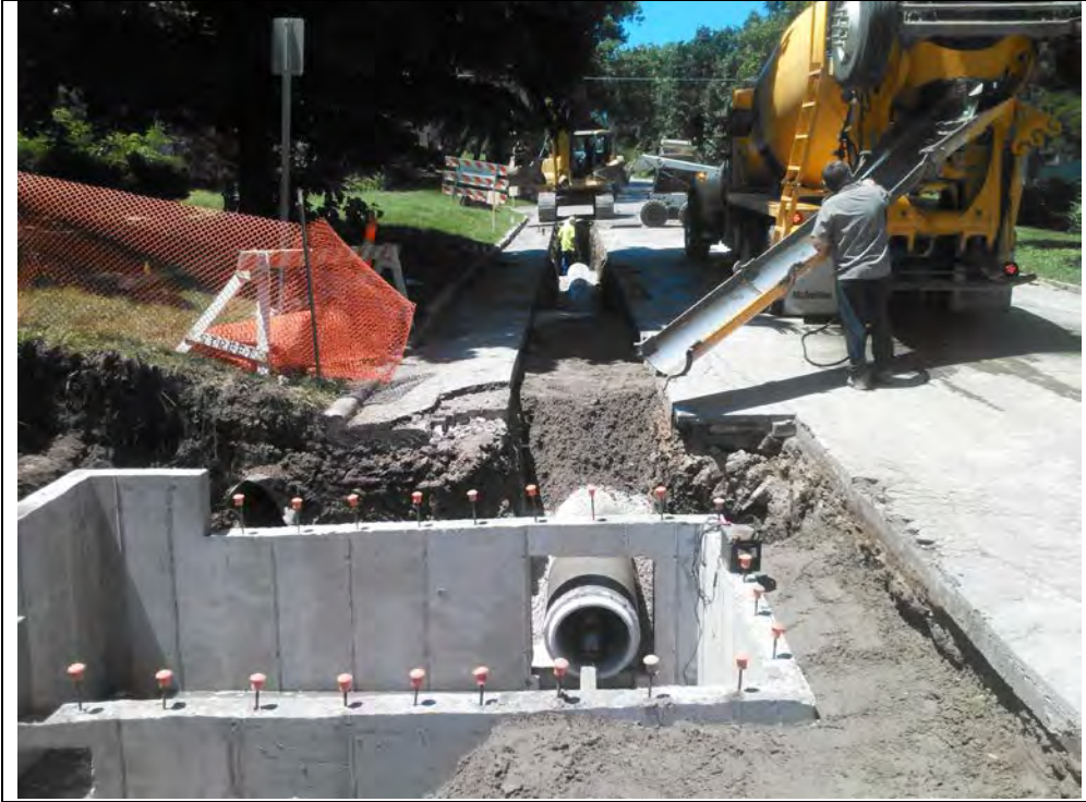
Westbound 10th Street west of Tennessee Street.