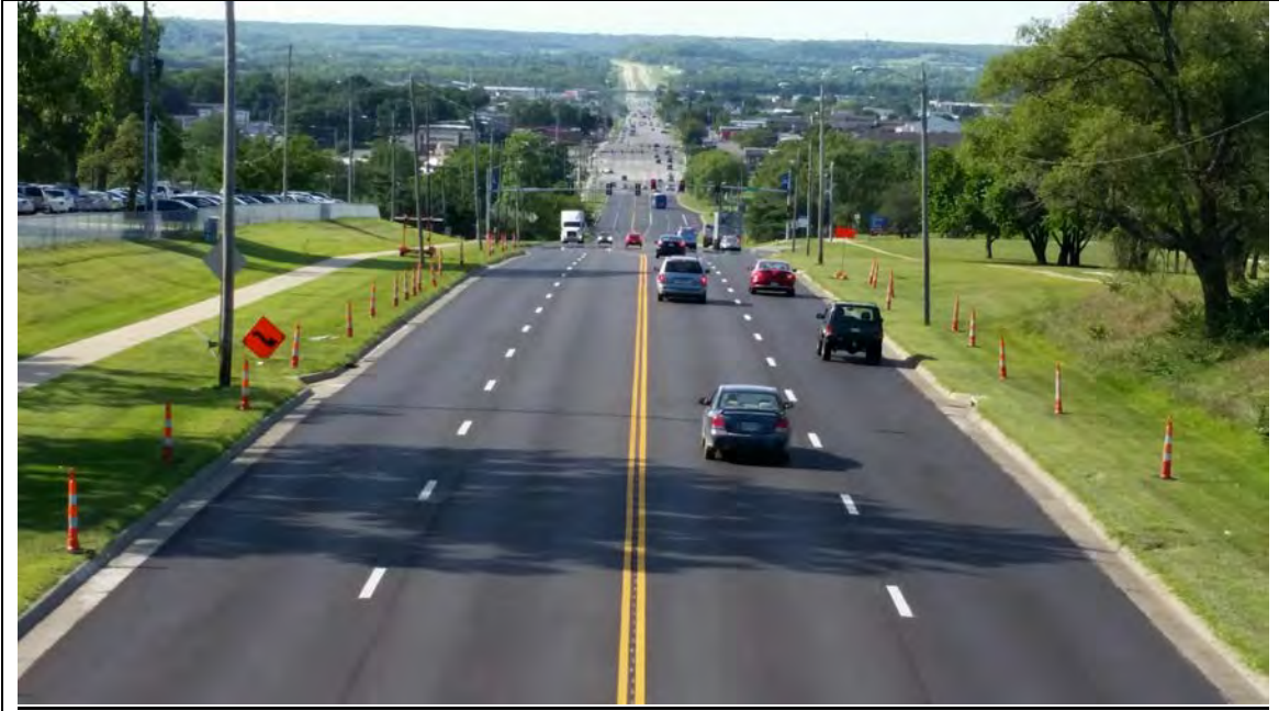
Southbound view of Iowa Street south of Irving Hill Bridge.

The 2015 KLINK project included the mill and overlay of pavement on Iowa Street between 23rd Street and the Irving Hill Road bridge and Harvard Road to south of 6th Street. New pavement markings on the roadway and video detection camera systems were installed on traffic signals at the 19th & Iowa, Harvard & Iowa, and 9th & Iowa intersections. This project began June 22, 2015 and was completed August 7, 2015.