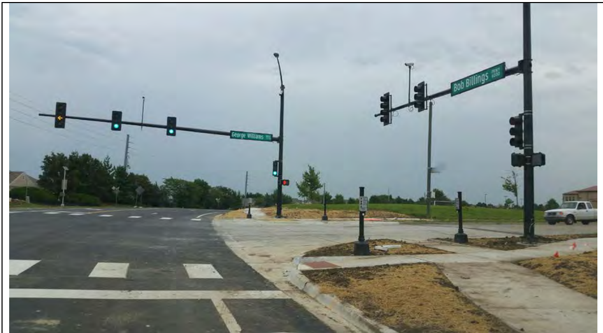
Eastbound Bob Billings Parkway @ George Williams Way.

This project included the installation of a traffic signal and the addition of dedicated left turn lanes at the intersection for eastbound and westbound Bob Billings Parkway. Bob Billings was also widened to the west to tie-into the KDOT interchange project and includes a center turn lane to promote safer turning movements for the existing Legend Trail Drive in addition to any future access points. The roadway was milled and overlaid and provided with new pavement markings. Construction began May 25, 2015 and project was completed August 17, 2015.