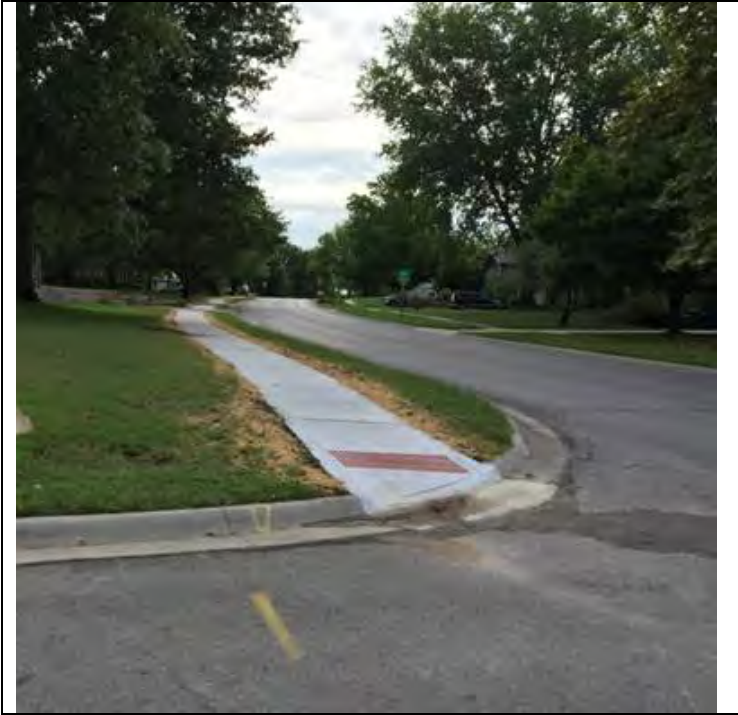
Eastbound 27th Street.