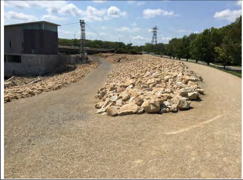
Kansas Levee near Bowersock Dam east of N. 2nd Street.