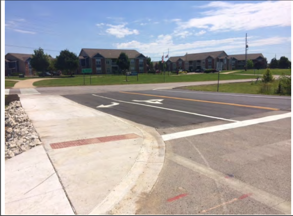
North leg of intersection at 27th Street & K-10.