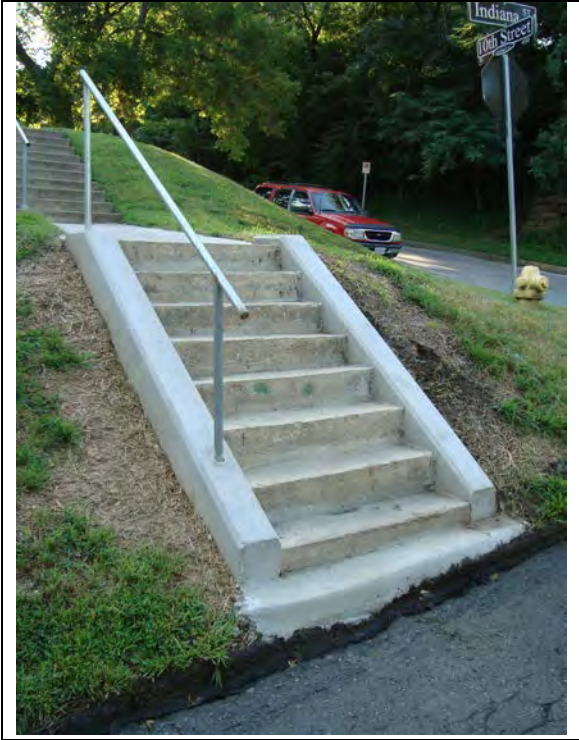
Replaced Stairway at corner of 10th & Indiana Streets.