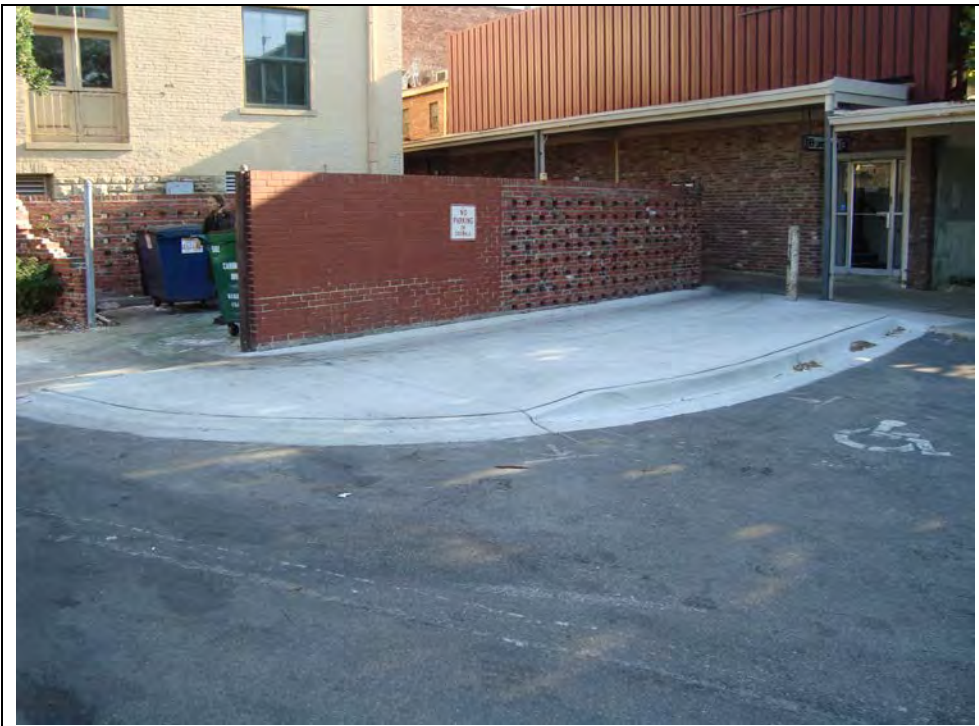
Lot#3 curb and sidewalk replacement behind The Buckle south of 8th & Massachusetts St.