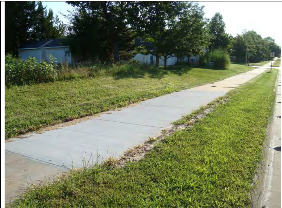
Replaced damaged panels of Peterson Road Recreation Path just west of N. Crestline Drive.