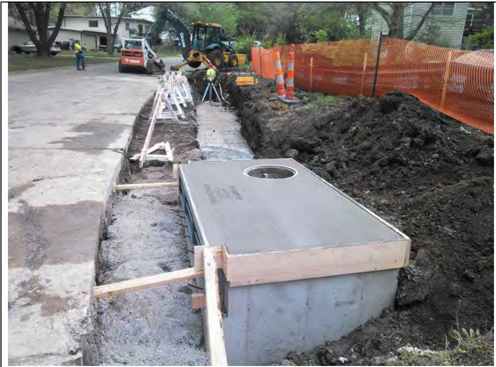
Southbound Cedarwood Avenue south of 25th Street.