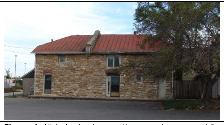
Figure 1. Historic structure on the property, proposed for use as a bar/bistro.