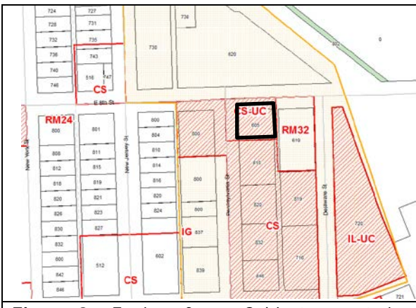
Figure 2a. Zoning of area. Subject property is outlined. Hatched area -- conditional zoning. Stippled yellow area -- UC (Urban Conservation Overlay) District.

RM32-UC (Multi-Dwelling Residential with Urban Conservation Overlay) District; Multi-Dwelling Structure (Figure 2)