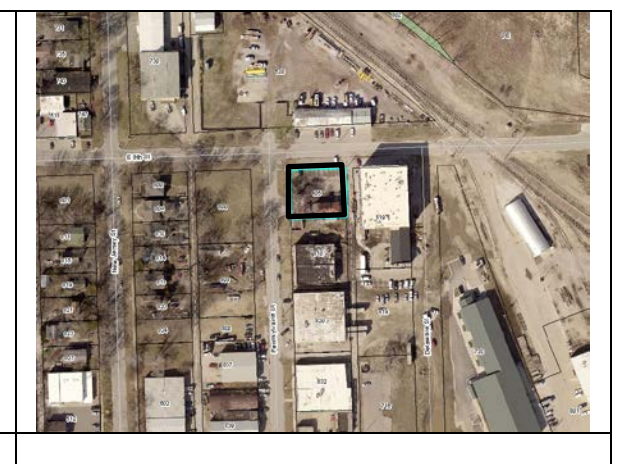
Figure 2b. Land use in the area. Subject property is outlined.

Figure 2a. Zoning of area. Subject property is outlined. Hatched area -- conditional zoning. Stippled yellow area -- UC (Urban Conservation Overlay) District.