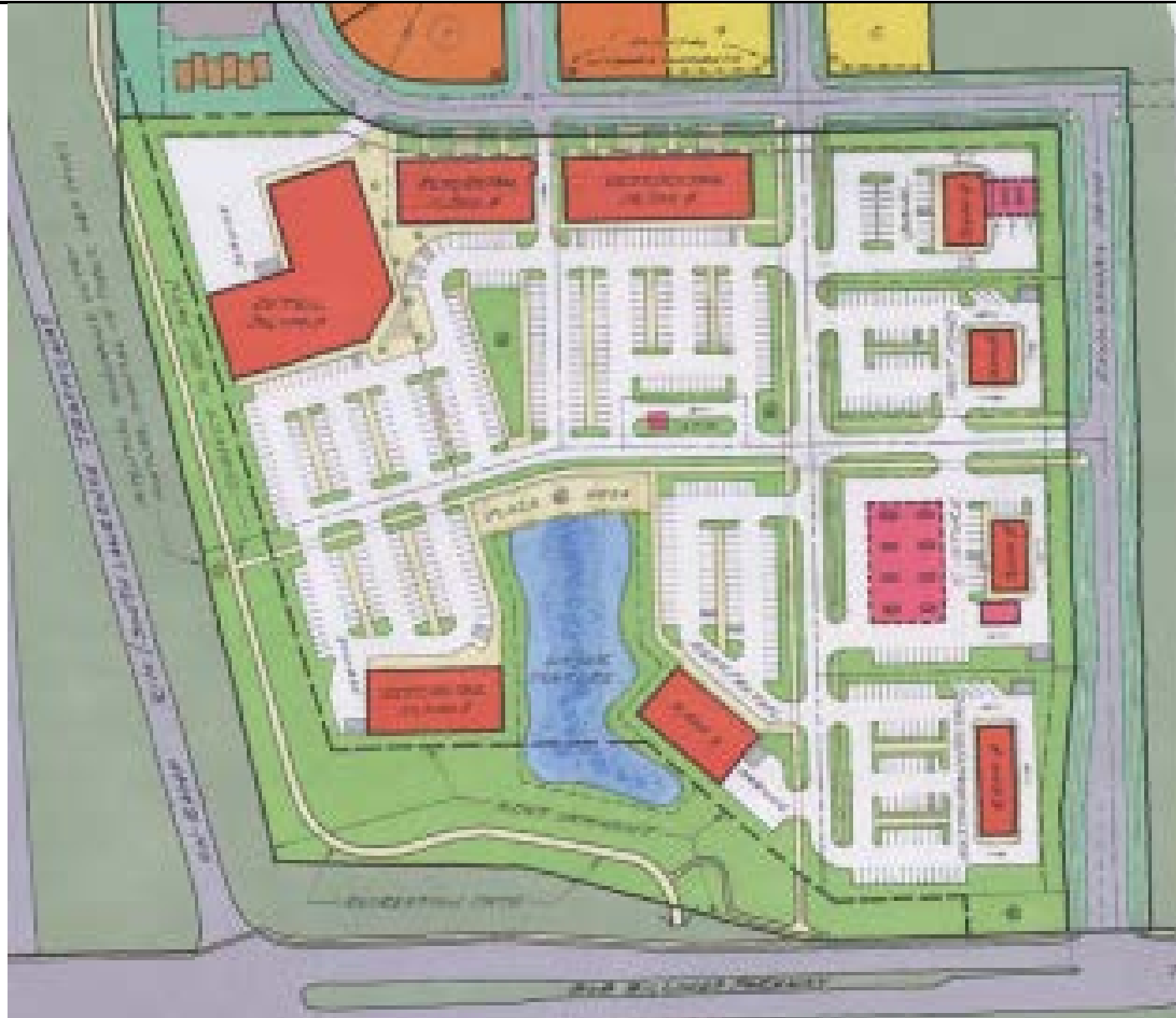
2013 concept plan with detention feature