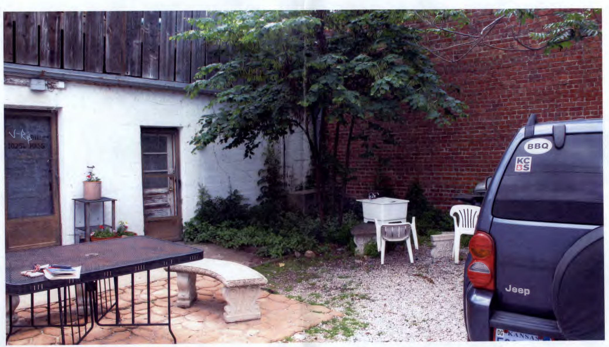
Adjacent South WALL