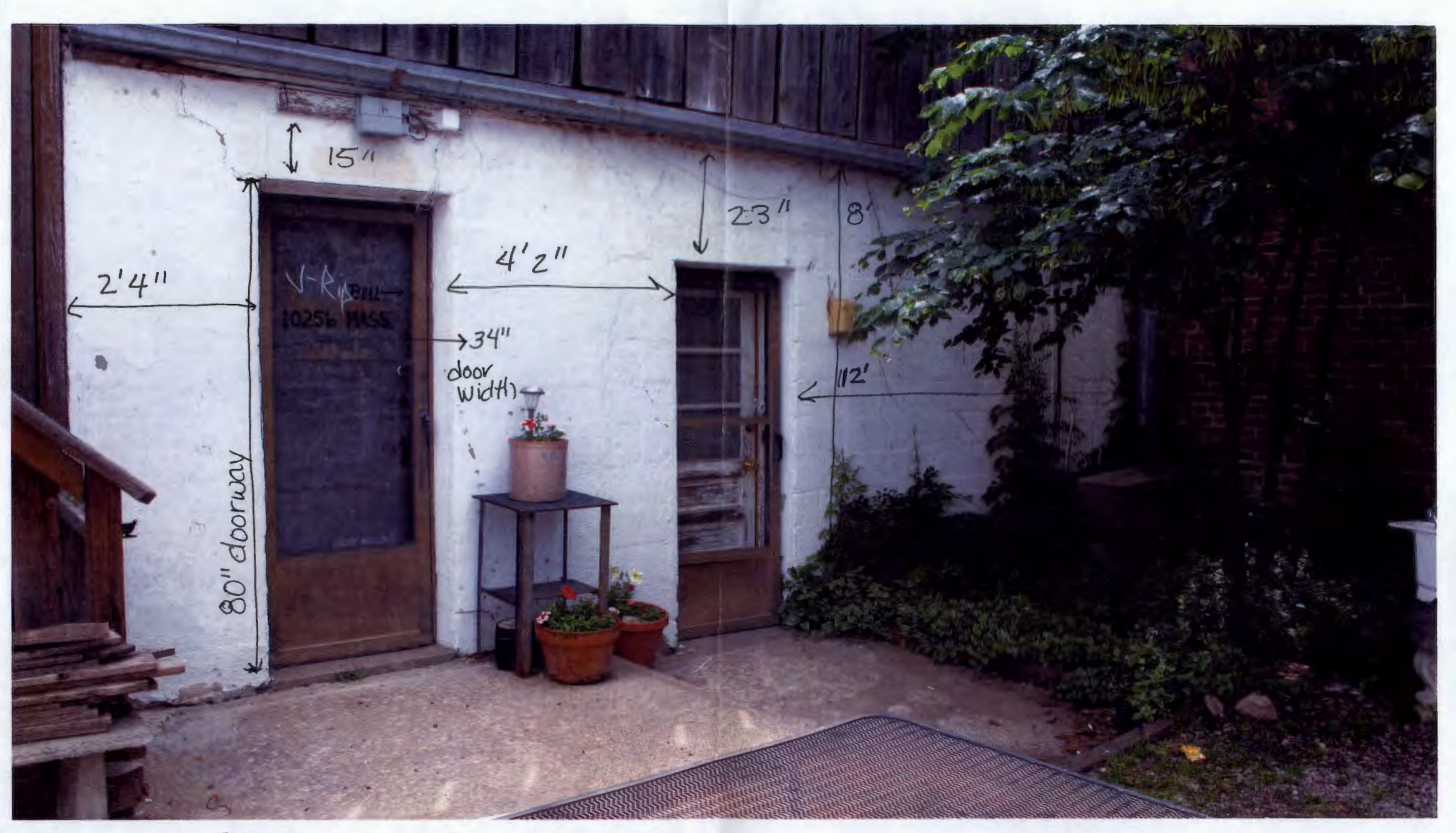
EAST WALL for proposed signage