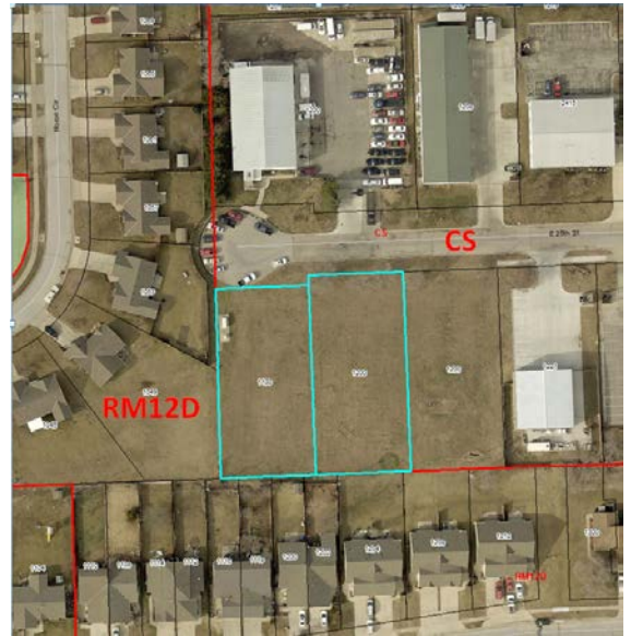
Figure 1. Current development of subject property.