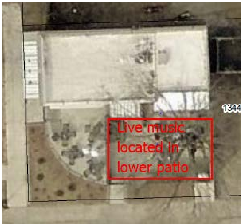
Figure 1. Aerial of Bullwinkles showing location of live music