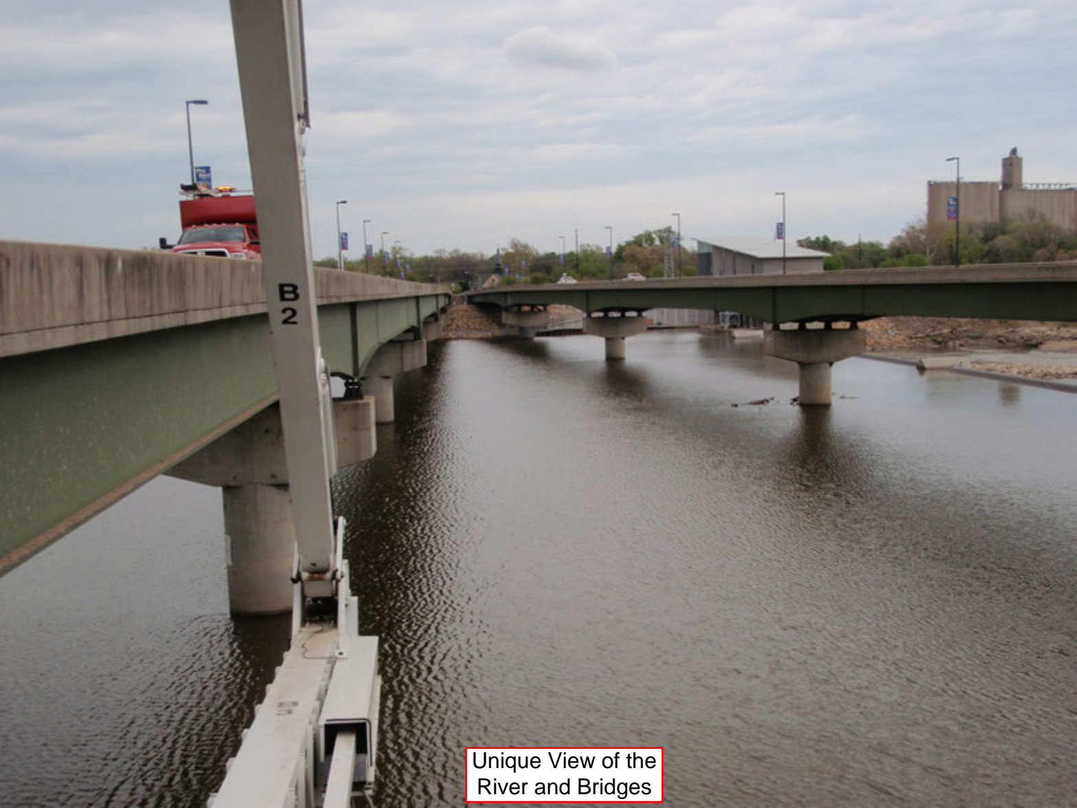
Unique View of the River and Bridges