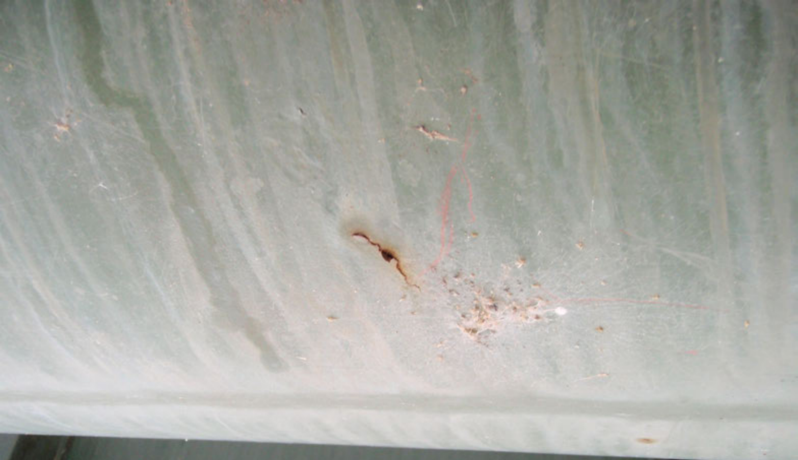
Imperfection in the rolled steel bottom of pipe in the same area as the previous with resulting rust