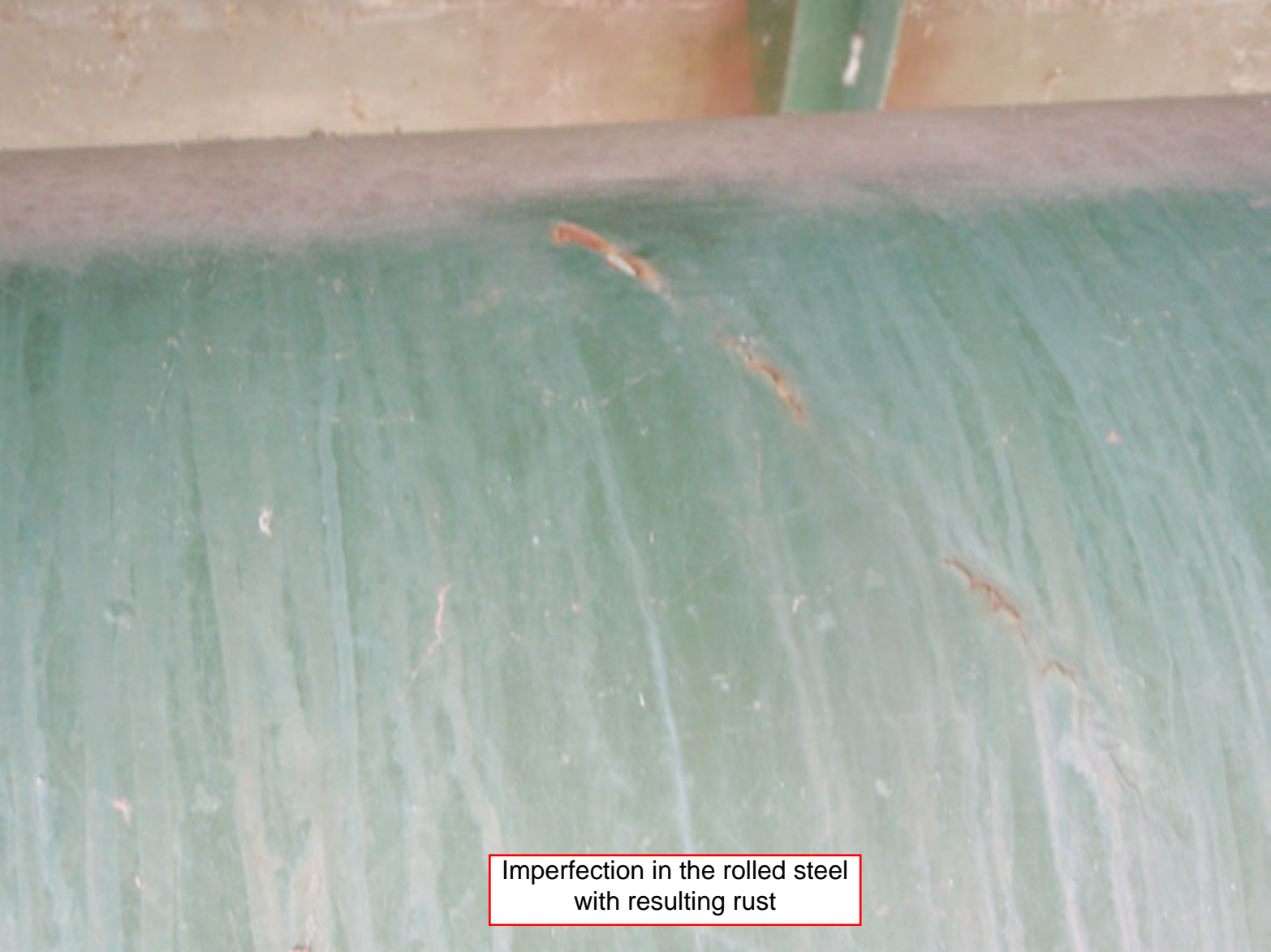
Imperfection in the rolled steel with resulting rust