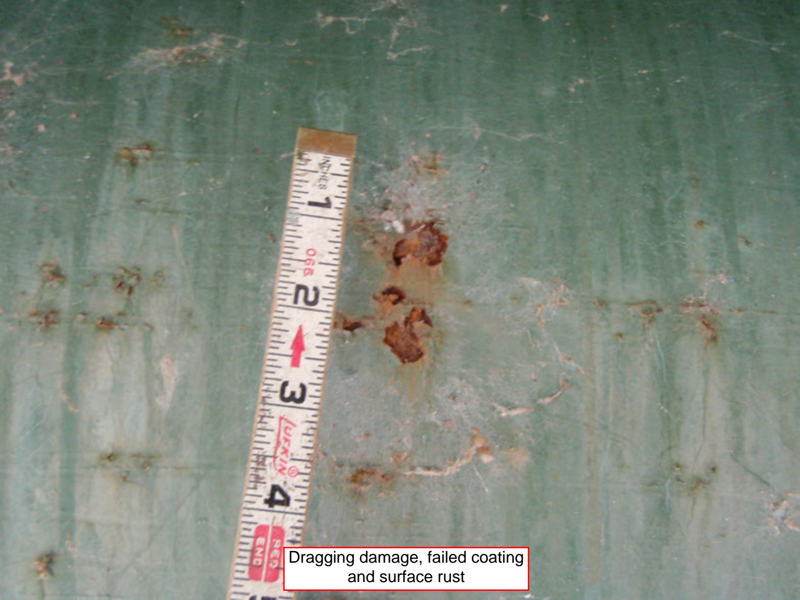
Dragging damage, failed coating and surface rust