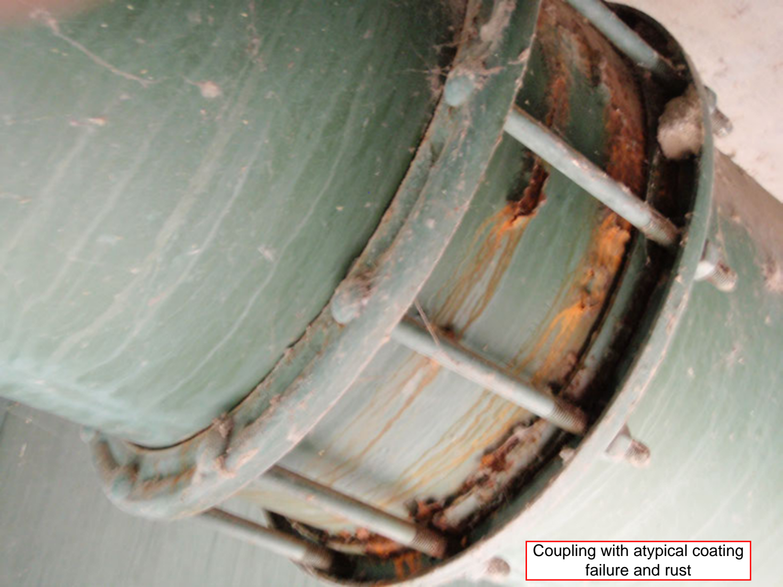
Coupling with atypical coating failure and rust