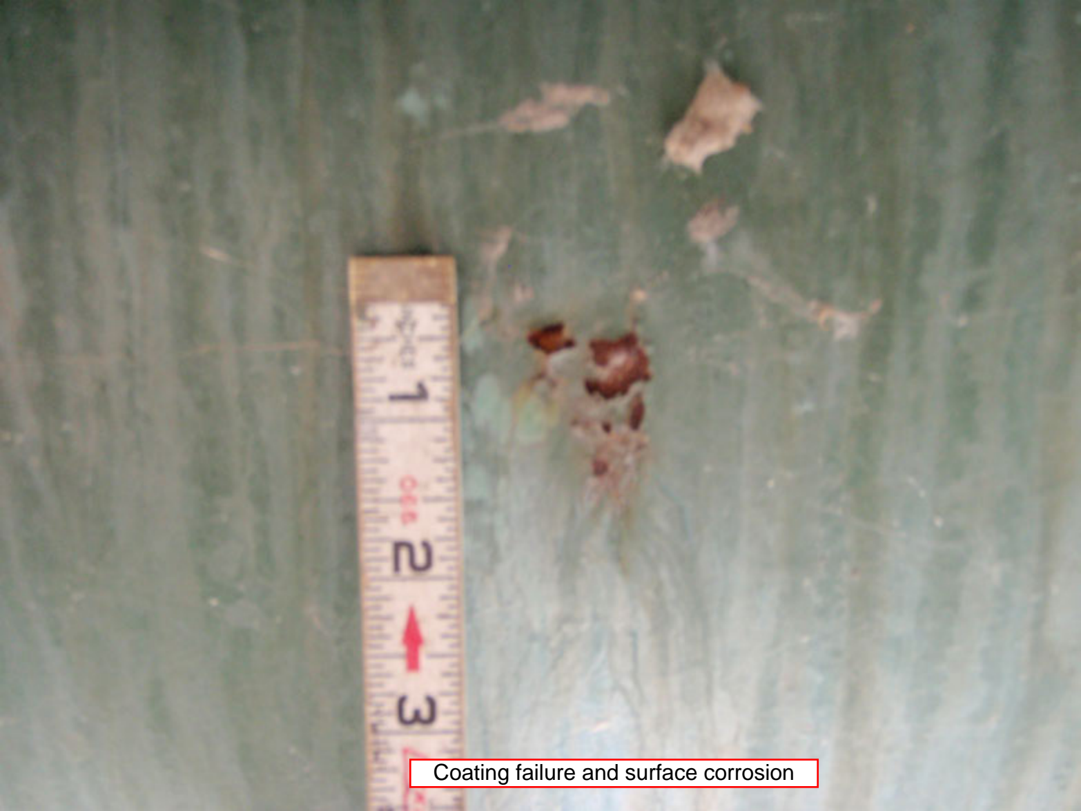
Coating failure and surface corrosion