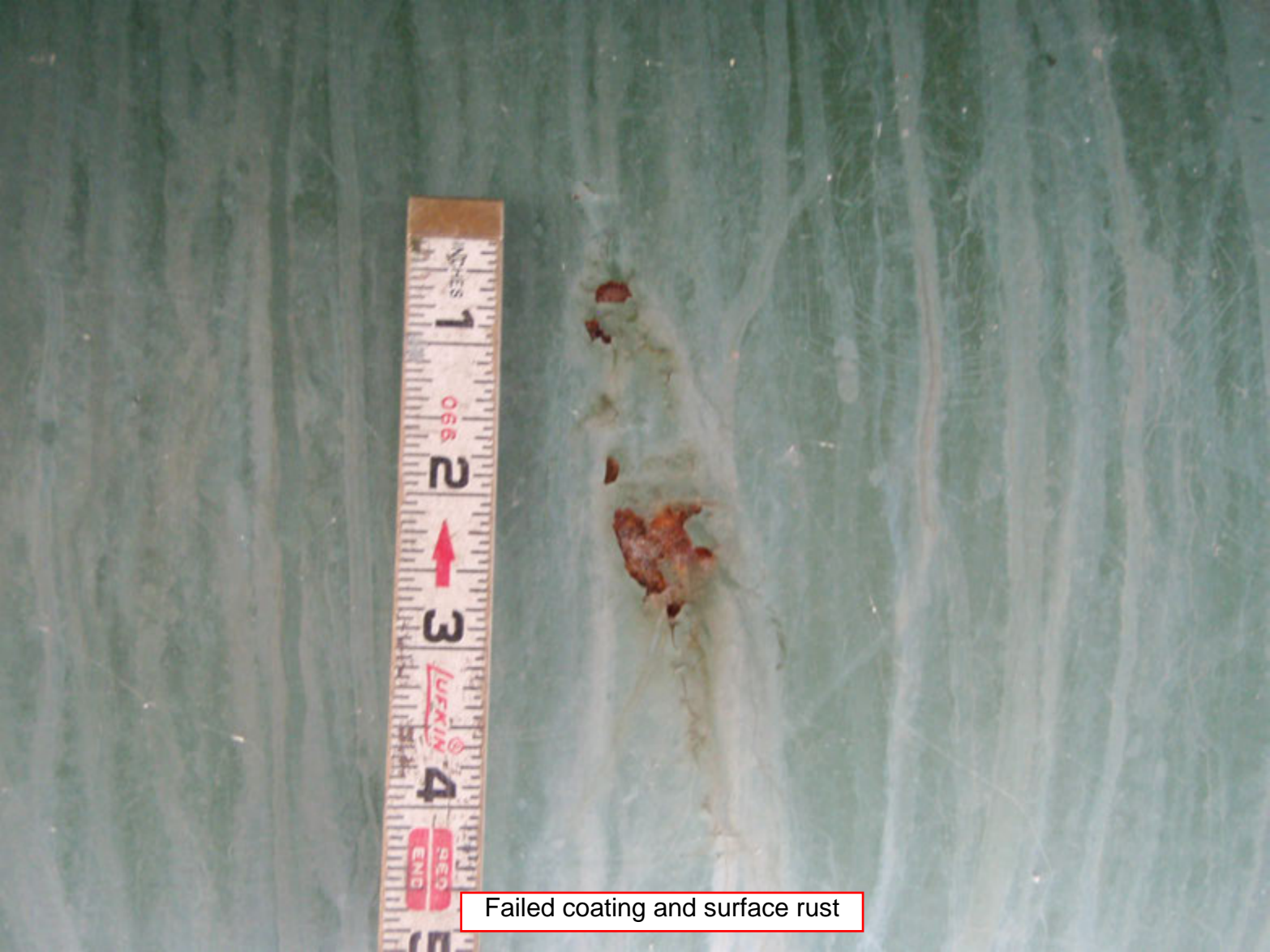
Failed coating and surface rust