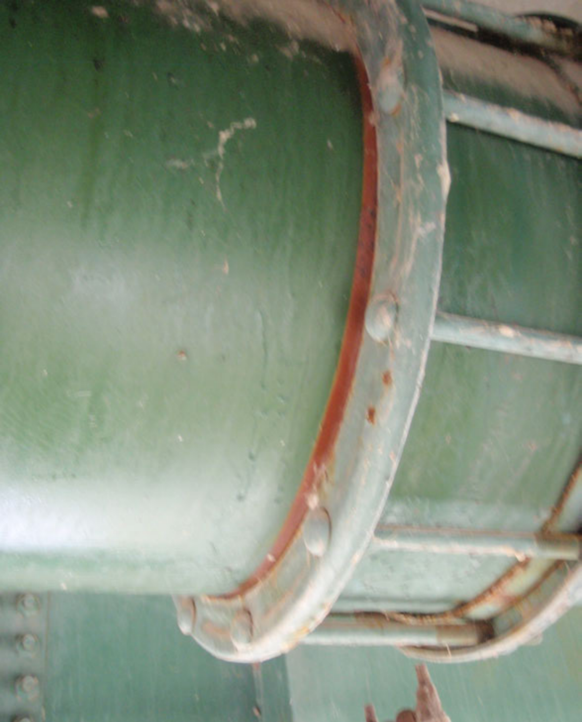
Coupling offset since coating. No evidence of leakage. Only one seen like it.