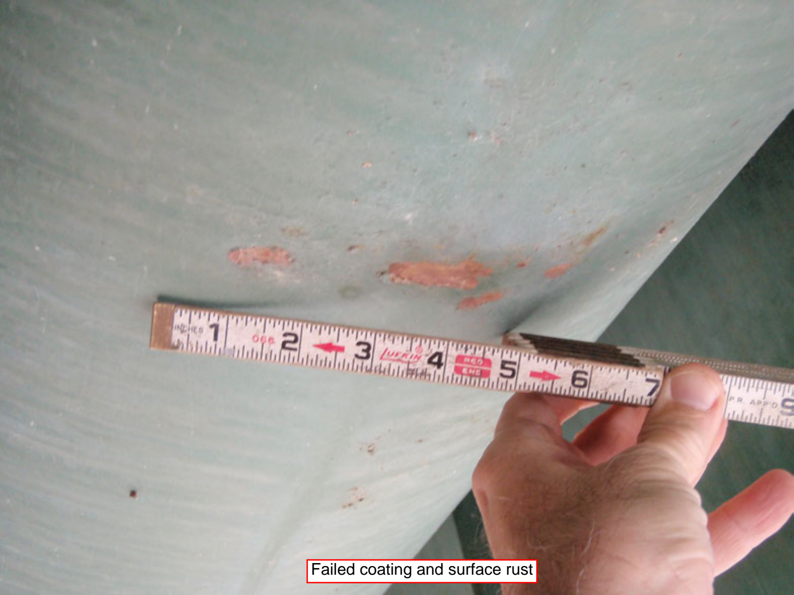
Failed coating and surface rust