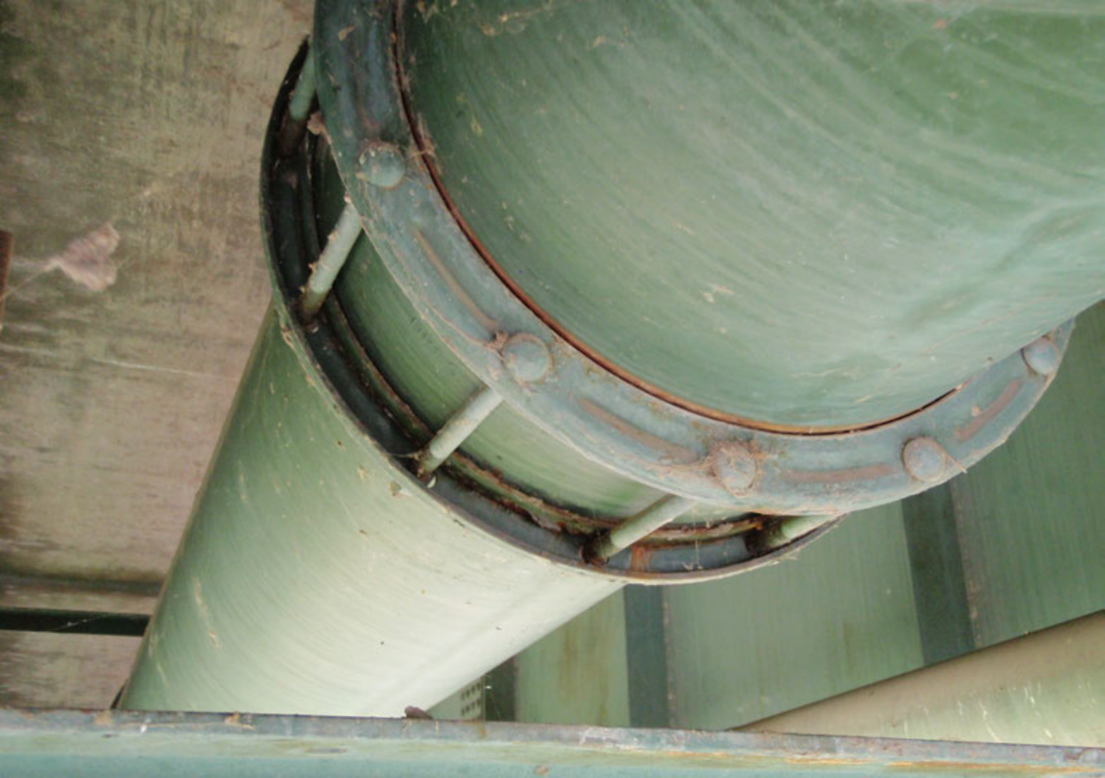
Typical coupling condition