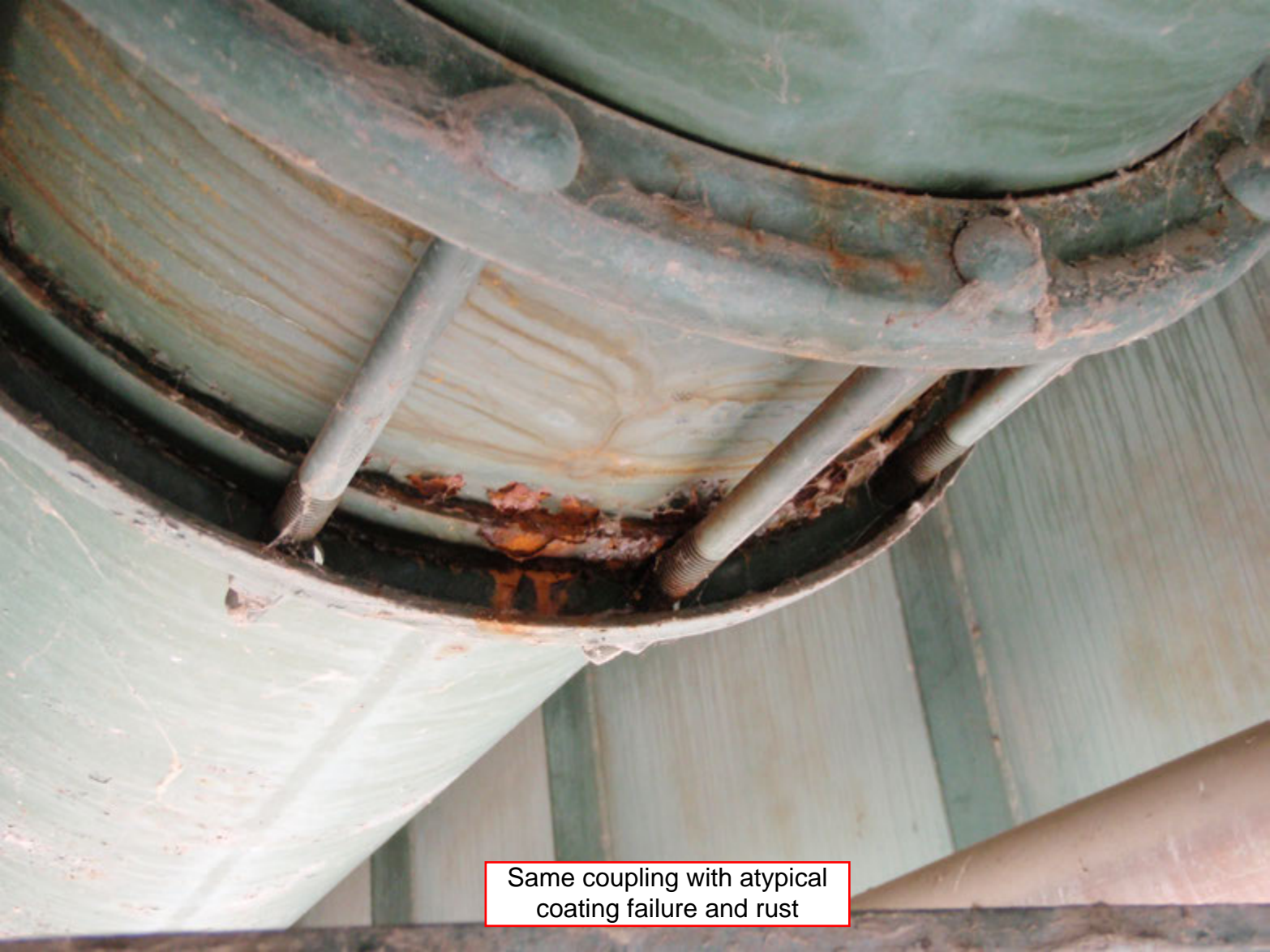
Same coupling with atypical coating failure and rust