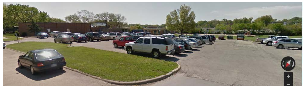
Figure 2: Existing Parking Lot Without Interior Landscpae

The south parking lot currently includes 44 spaces with a drop off lane around the perimeter of the site. The revised parking lot increases this lot by two (accessible) spaces located at the east end with a cross walk connecting to the main building to the north. These two spaces include new landscape to screen the spaces. The number of spaces located along the south side of the lot (16) does not change though new parking lot curb is added in the southeast corner of the lot. The existing playground located east of this parking lot will be relocated to the west side of the building with this project.