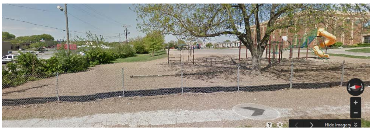
Figure 3: Existing Outdoor Play Yard

The south parking lot currently includes 44 spaces with a drop off lane around the perimeter of the site. The revised parking lot increases this lot by two (accessible) spaces located at the east end with a cross walk connecting to the main building to the north. These two spaces include new landscape to screen the spaces. The number of spaces located along the south side of the lot (16) does not change though new parking lot curb is added in the southeast corner of the lot. The existing playground located east of this parking lot will be relocated to the west side of the building with this project.