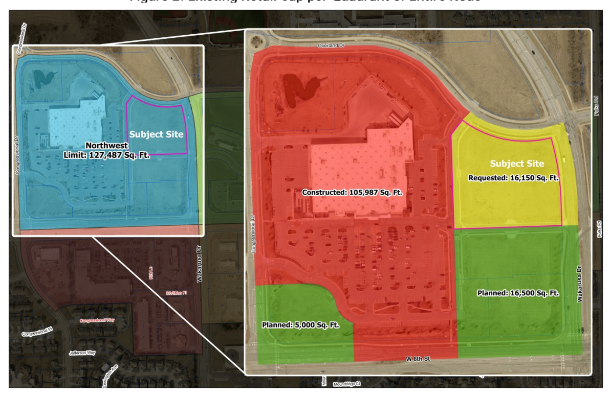
Figure 3: Northwest of Node: Existing Construction & Designated Spaces