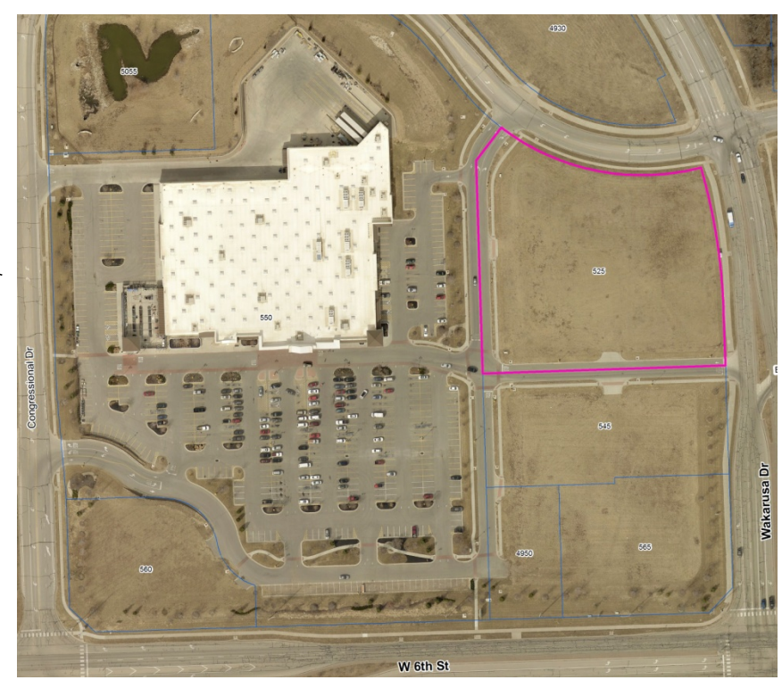
Figure 1: Subject Parcel and Surrounding Context (Aerial: 2014)

The applicant has requested an amendment to Horizon 2020: Chapter Commercial Land Use, and Chapter 14, Specific Plans, amending the An Area Plan for the Intersection Area of West 6th Street & Wakarusa Drive to revise the retail cap for retail development at the northwest quadrant of the intersection of W. 6th Street and Wakarusa Drive. reason for this Comprehensive Plan Amendment is to request an expansion of the commercial center at the northwest quadrant by increasing the retail cap for this portion of intersection from