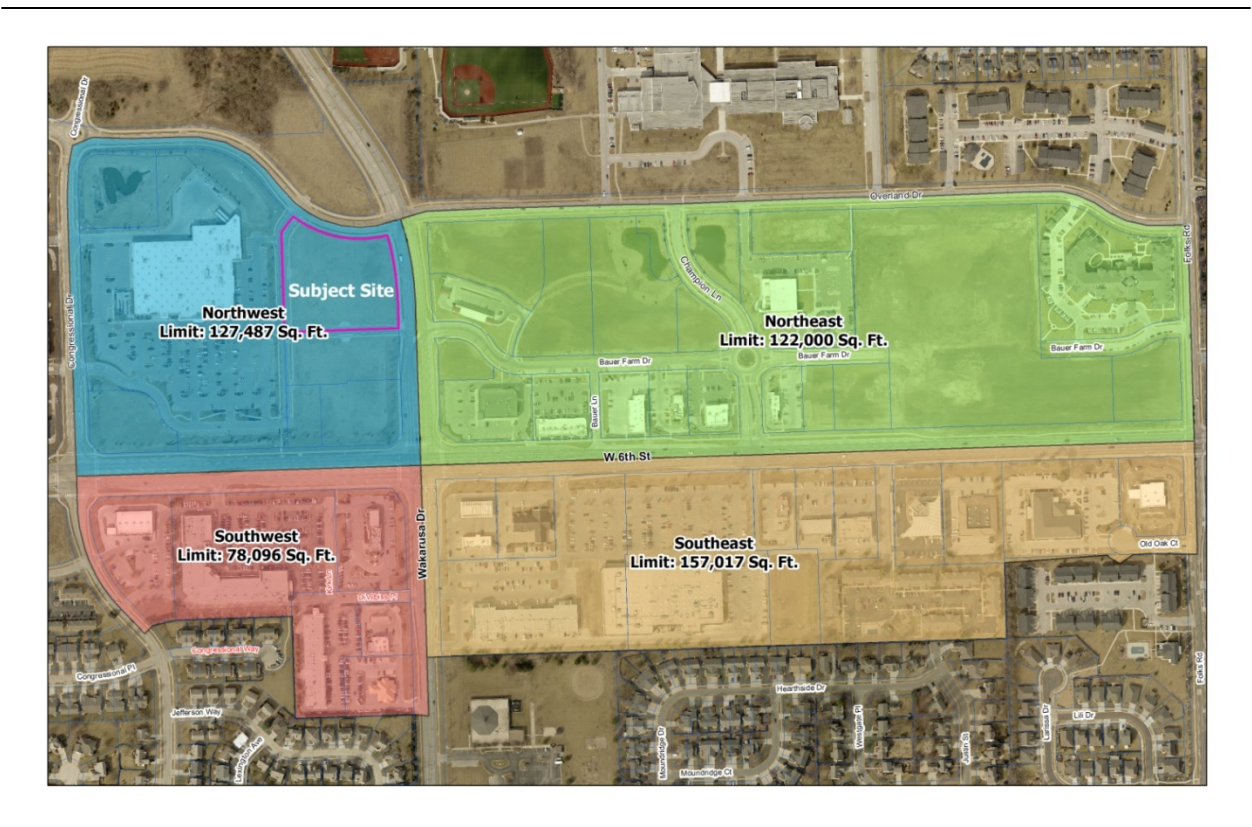
Figure 2: Existing Retail Cap per Quadrant of Entire Node