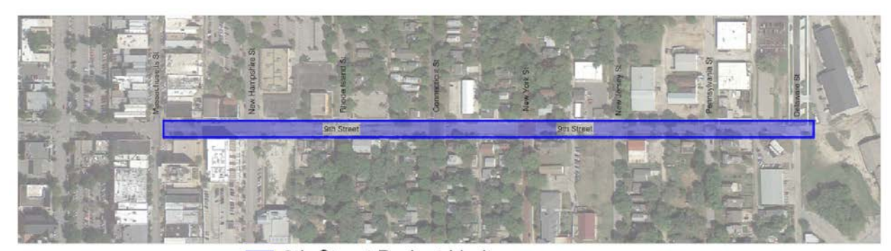
9th Street Project Limits