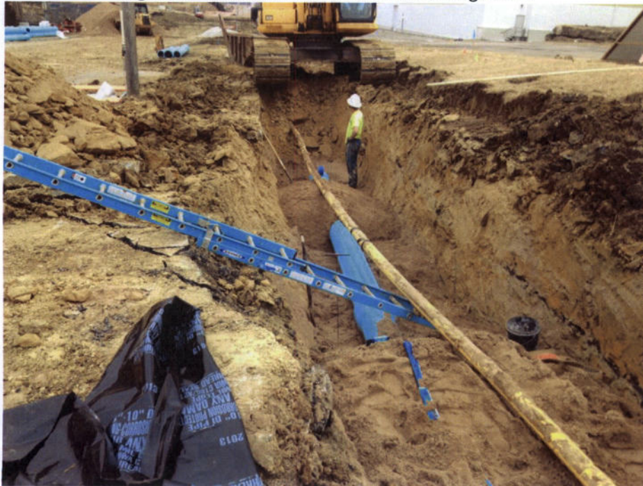
Figure A – Waterline Station 208+00 Looking South

As discussed verbally on Friday March 10, 2014 and as required by the contract documents Emery Sapp & Sons, Inc. (ESS) is providing notice of differing site conditions and as a result of these unforeseeable circumstances will incur additional costs and require additional contract time. Specifically, as part of the U-2117-01 project ESS is to replace an existing 12" waterline along a new alignment as indicated on sheet 105 of the current plans. When ESS began to install the new waterline it became apparent that a Black Hills Energy gas main that was relocated as part of the K10 8392-04 "South Lawrence Trafficway" (SLT) project was relocated in such a way that is now directly over the path of the waterline as shown in Figure A.