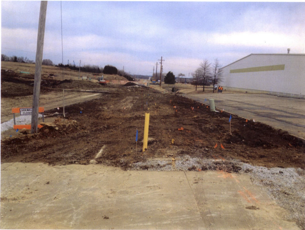
Figure B – Waterline Station 205+50 Looking South

The relocated gas line was installed in such a way that it either runs concurrent with the waterline alignment or meanders from one side of the alignment to the other as can be seen in figures B and C. When the line is not running with the waterline it is crossing it. The gas line remains in conflict for the entirety of the waterline alignment from stations 200+00 to 209+73 as shown on sheet 105 of the current plans.