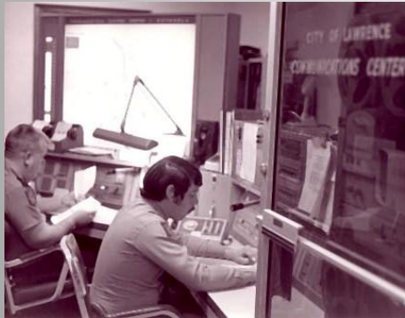
Police Department Communications Center Late 60's-Early 70's