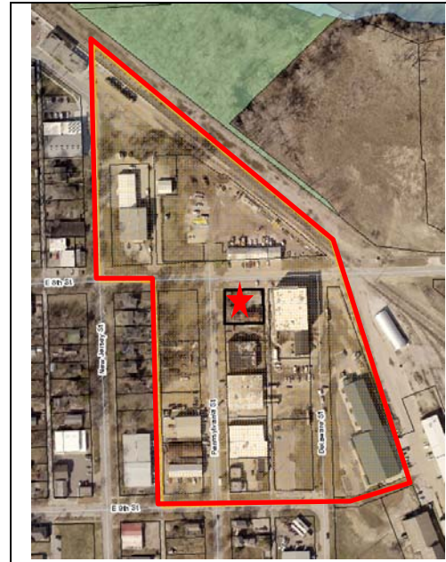
Figure 2. 8 th & Penn Neighborhood Redevelopment Zone outlined. Subject property marked with a star.