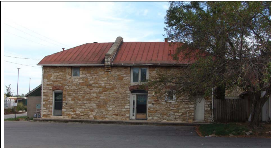
Figure 1. Historic structure on the property, proposed for use as a bar/bistro.