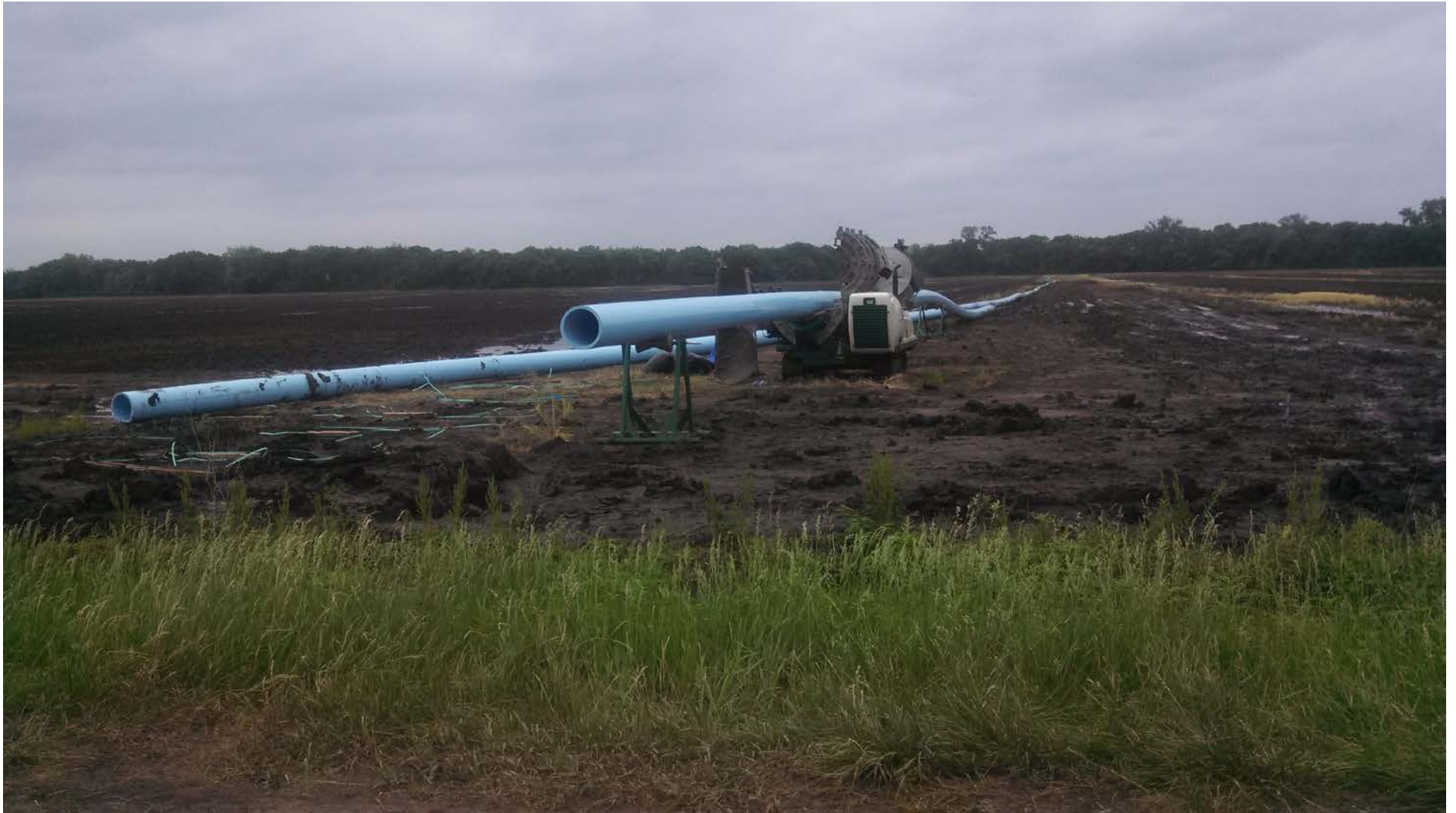
16-Inch Watermain on the Wakarusa WWTP Property Ready for Installation