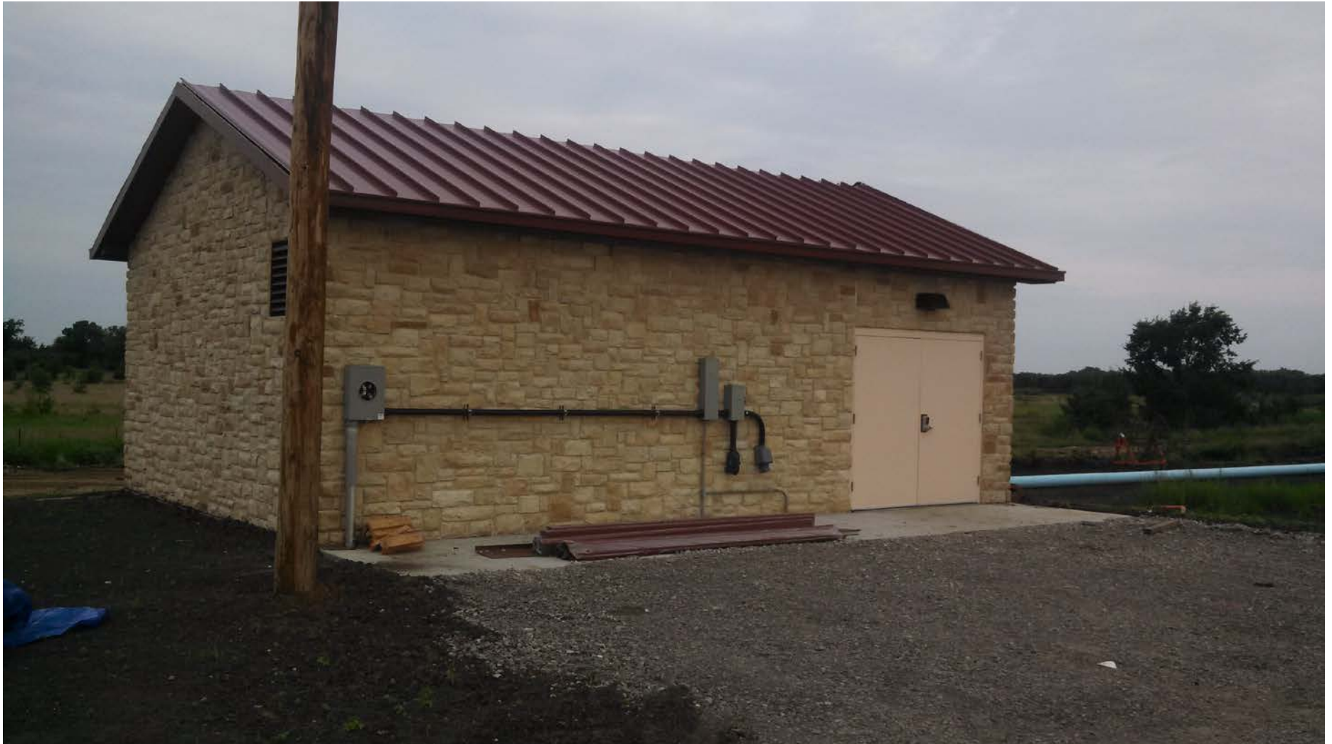
Water metering station for Baldwin City and RWD #4.