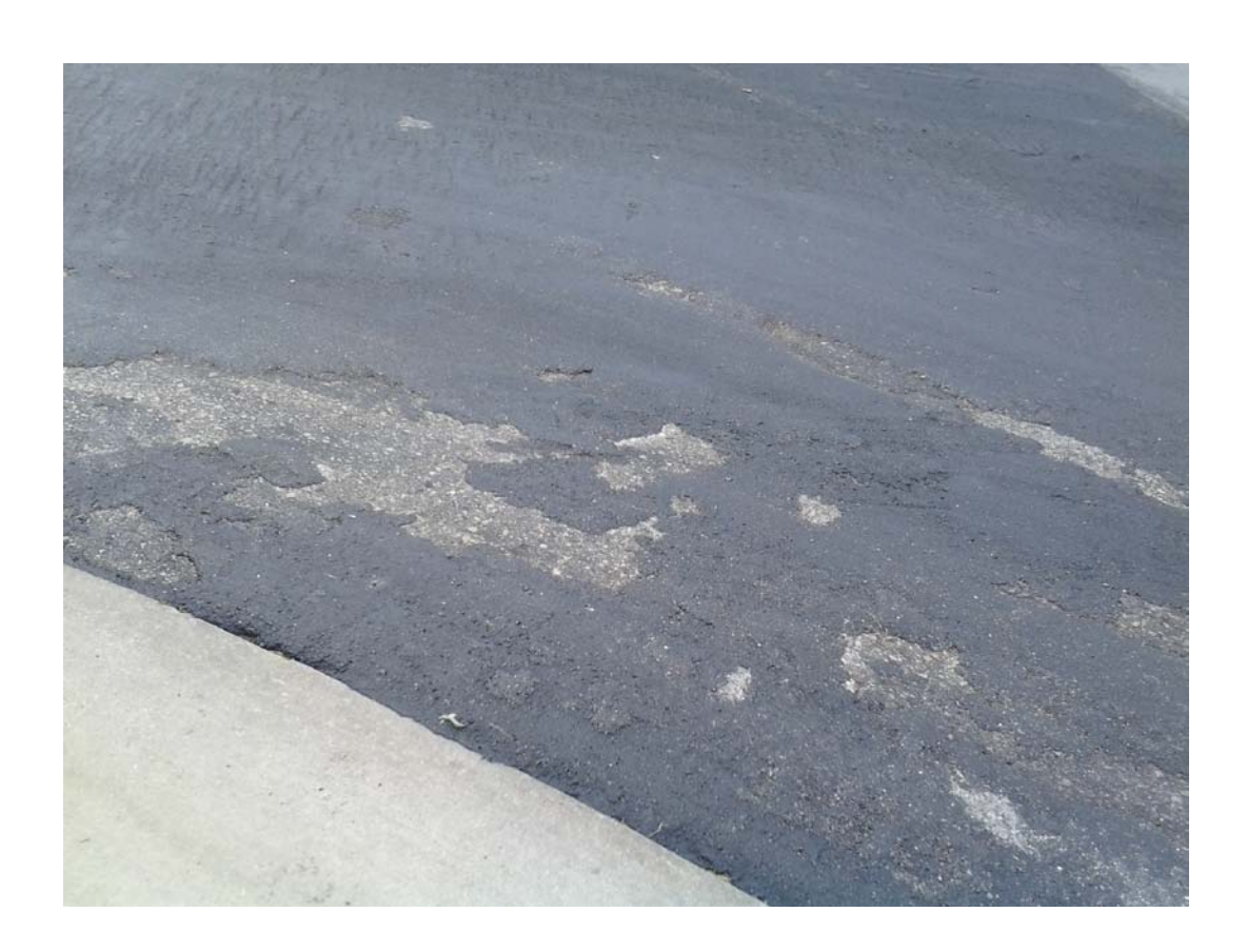
Folks Rd (south of 6^{\text{th}} St) – example of heavy loss of material from vehicles