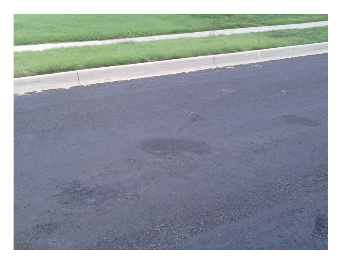
Lili Dr - example of power steering marks with loss of seal, completed with minor patching