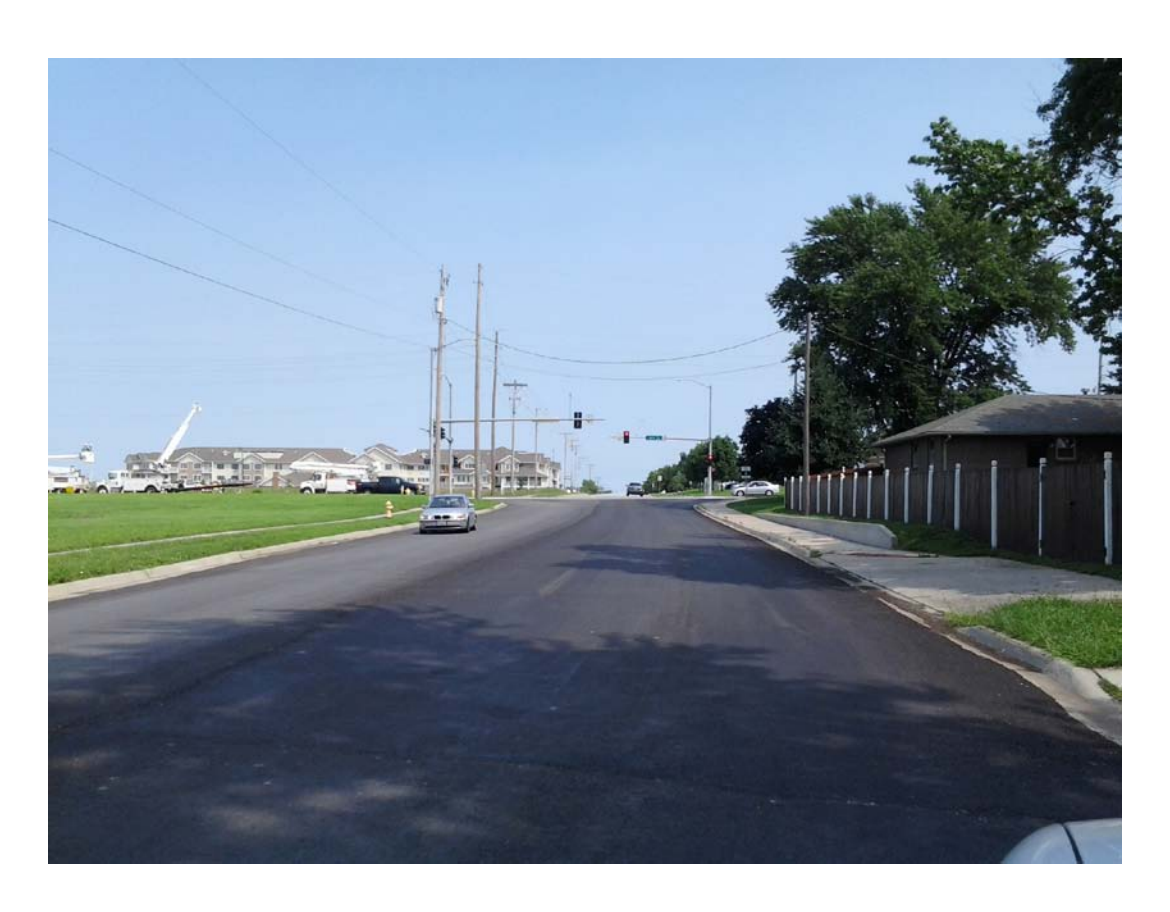
Folks Rd (south of 6<sup>th</sup> St) – after patching/ reapplication of surface seal by machine