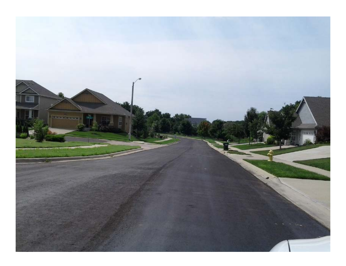
Larissa Dr near cul-de-sac – rougher texture apparent but typical in bulb areas where there is overlap of the application passes of the surface seal machine