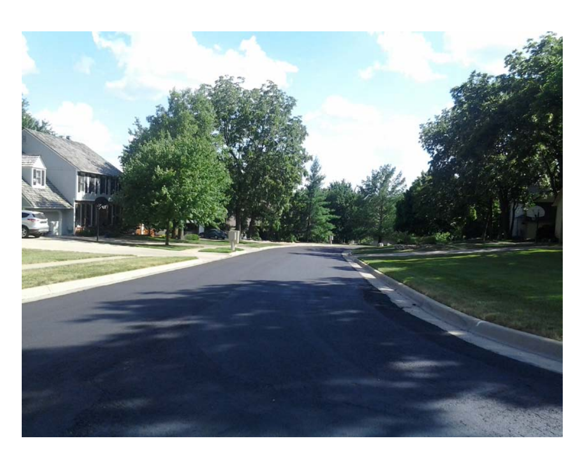
Royal Birkdale Ct - completed