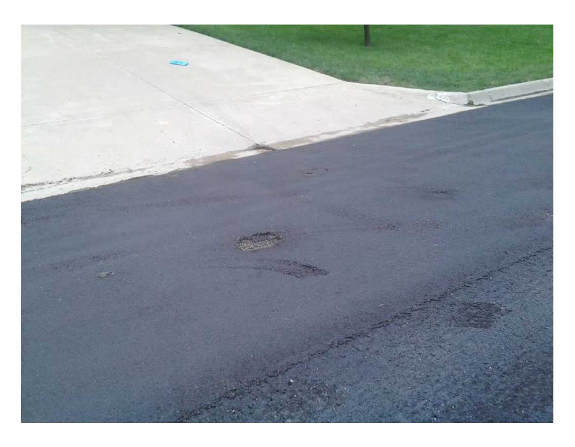
Vantuyl Dr – example of power steering marks, some leading to complete loss of seal requiring minor patch