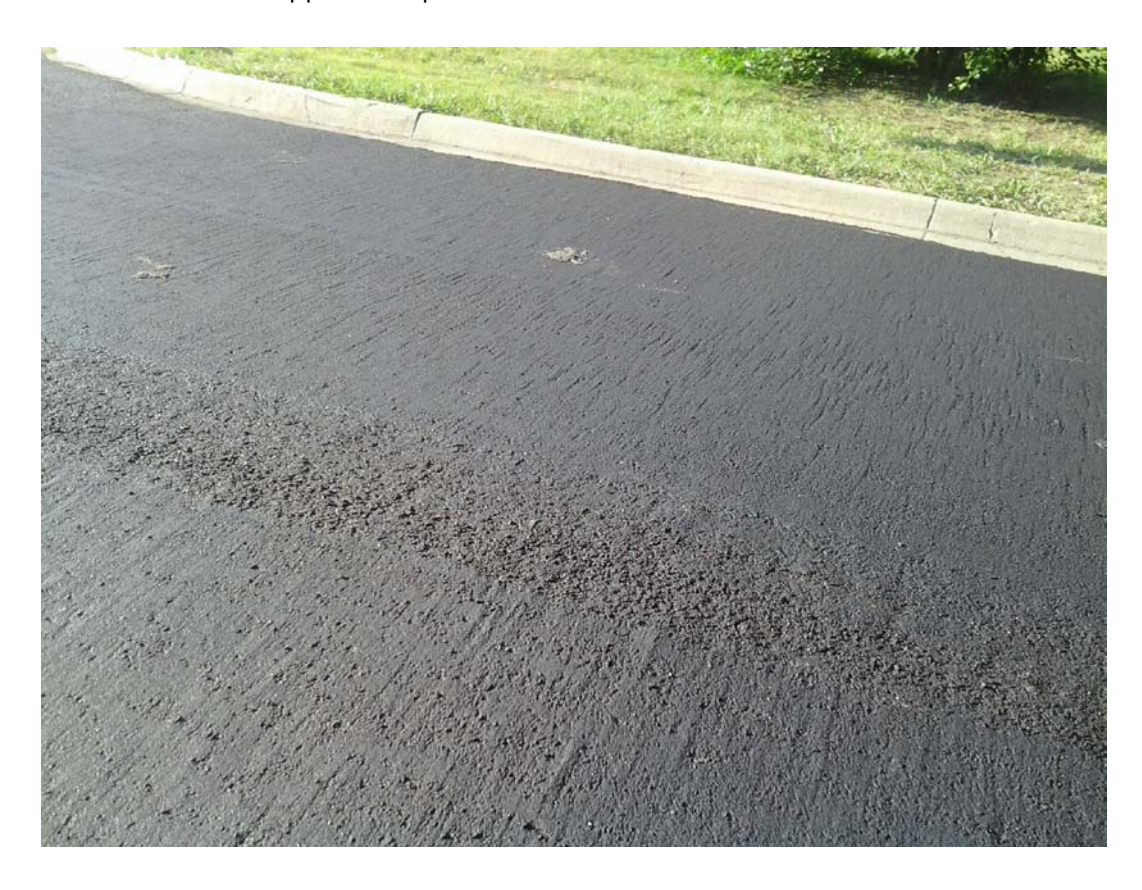
Example of microsurface seal with rougher texture than a roller compacted 2" mill and overlay; Over time and with traffic, the material will tend to smooth out more