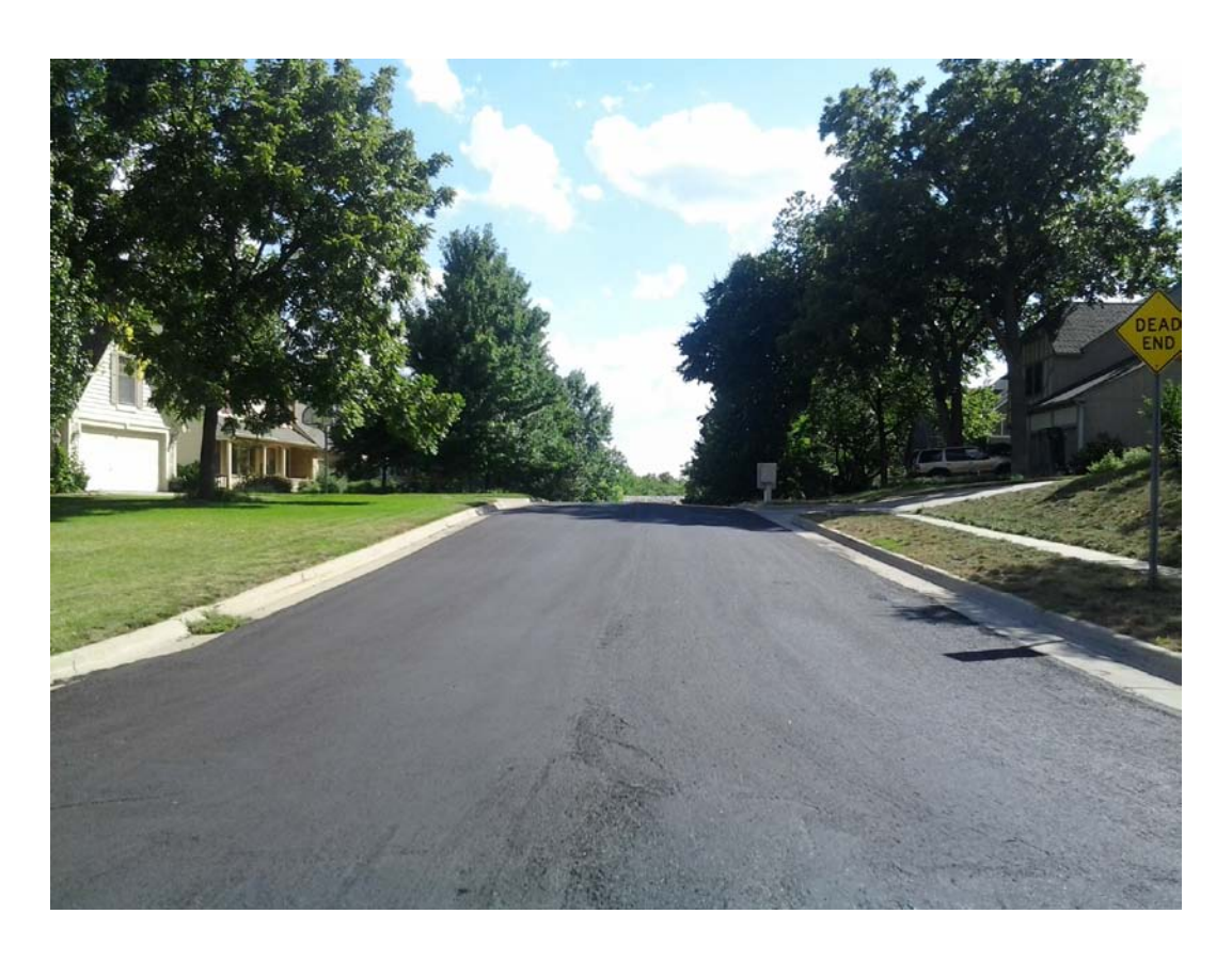
Cedar Ridge Ct - completed