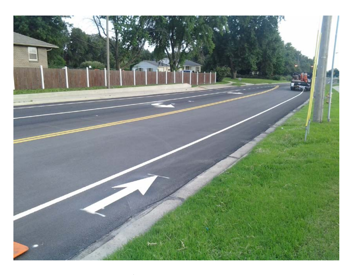
Folks Rd (south of 6<sup>th</sup> St) – completed with pavement markings