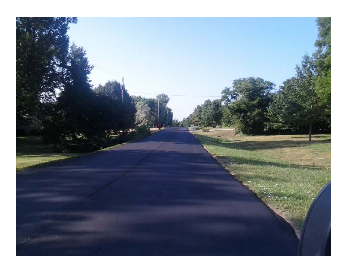
Wagon Wheel - completed