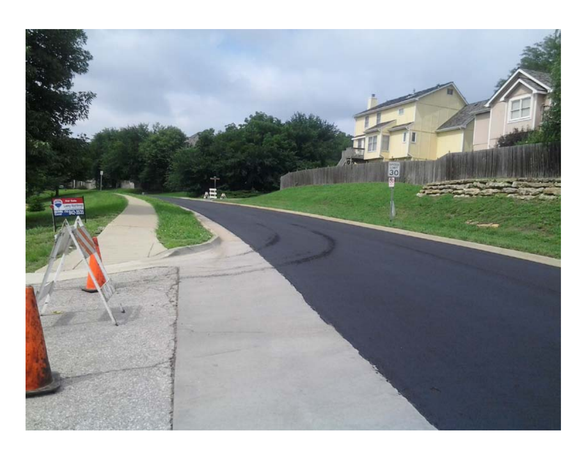
Inverness Dr – example of seal damage from aggressive vehicle turn near a temporary road closure