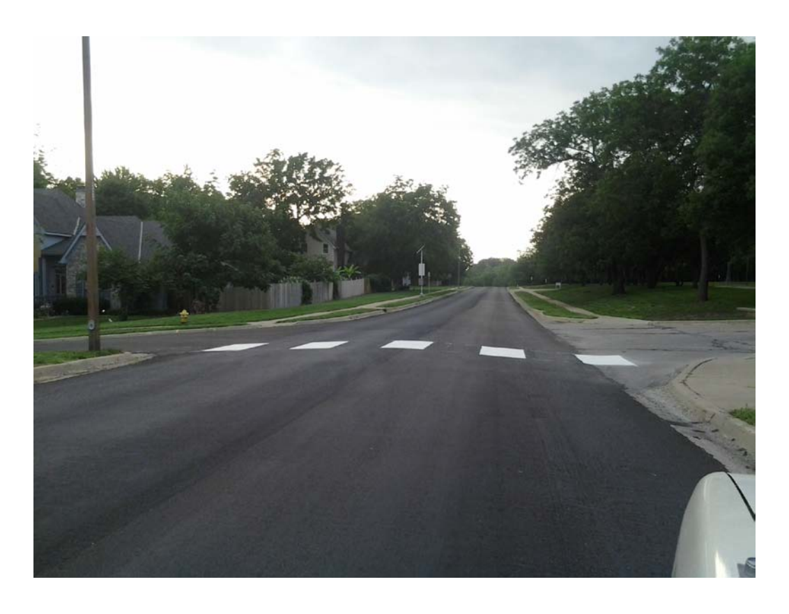
Inverness Dr – completed with payment markings/ crosswalk near Quail Run Elementary