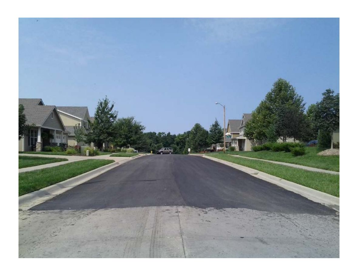
Larissa Dr - completed