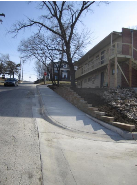
11th and Indiana