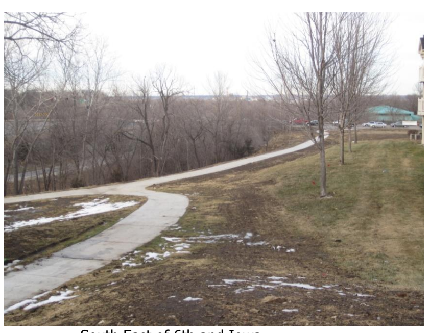
South East of 6th and Iowa