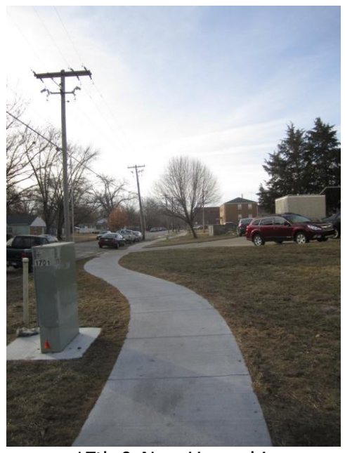
17th & New Hampshire