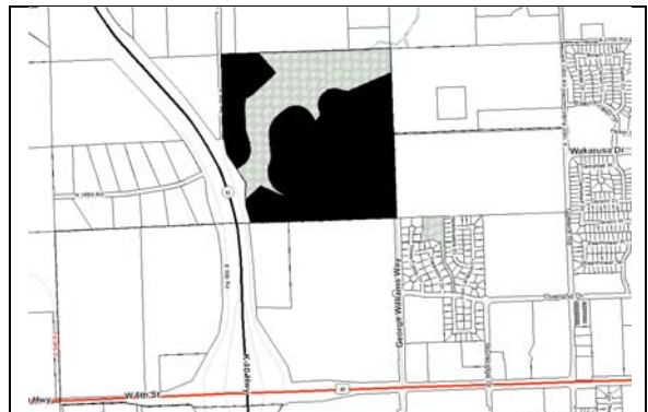
Figure 1. Parcels included in annexation request shown in black, parkland is identified with hatchmarks.