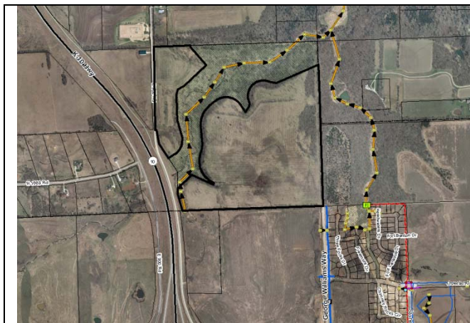
Figure 3 Utilities in area. City sanitary sewer mains shown in orange, city water mains shown in blue.

George Williams Way is also classified as a collector street in this location and half of the required right-of-way will be dedicated with the platting of the property. Half of this right-of-way will be dedicated with the platting of the property to the east, currently in process of being platted as The Links, or may be dedicated by separate instrument in conjunction with this project. (Figure 4)