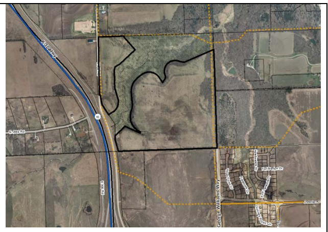
Figure 4. Current and future transportation network in area. Solid orange lines are current collector streets, dashed lines are future collector streets.