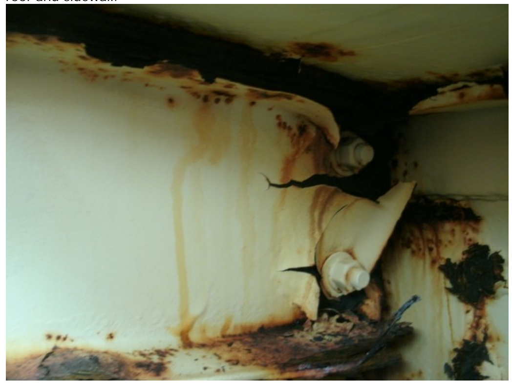
Corrosion has deteriorated coating causing metal loss of many of the roof beams.

Severe corrosion and coating failure as seen on the below beam as it attaches to the roof and sidewall.