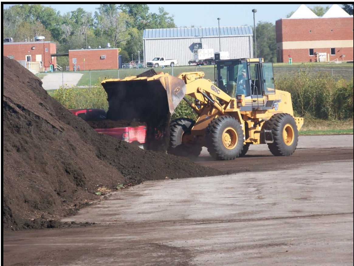
September 29 th - The majority of vehicles through our facility were trucks, which were loaded with either of two front end loaders.