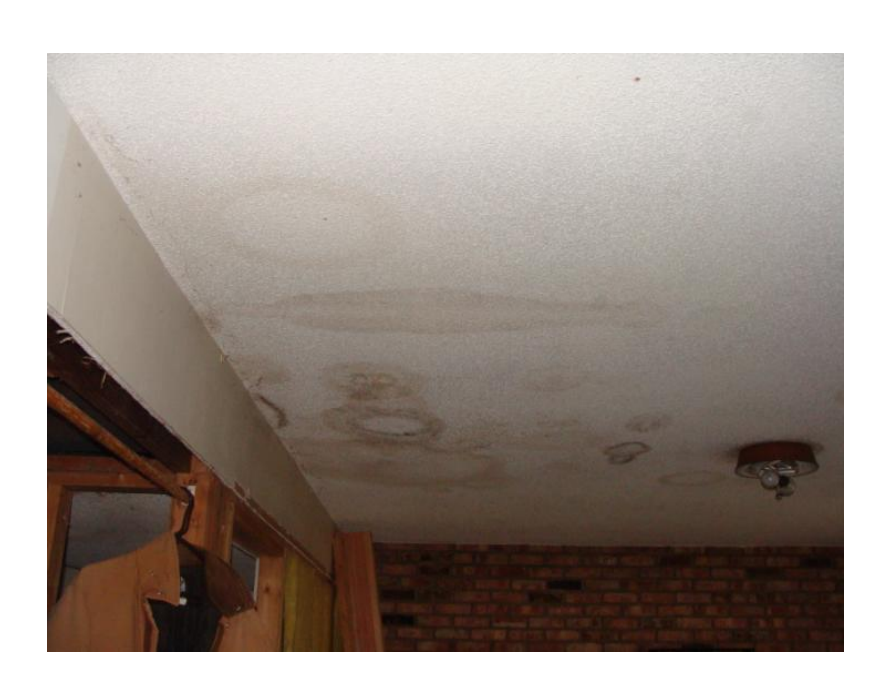
Basement – utility room area: