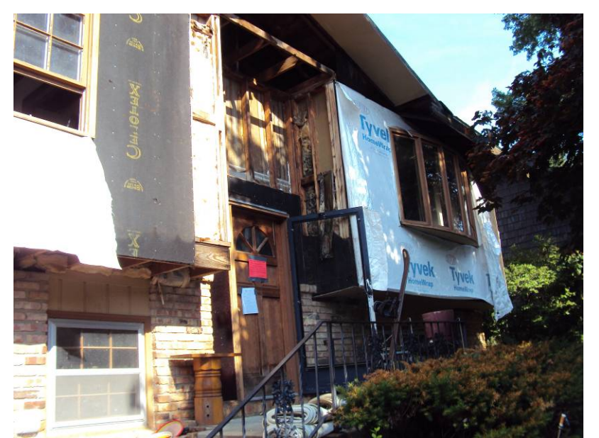
Front entry – exposed wiring and insulation: