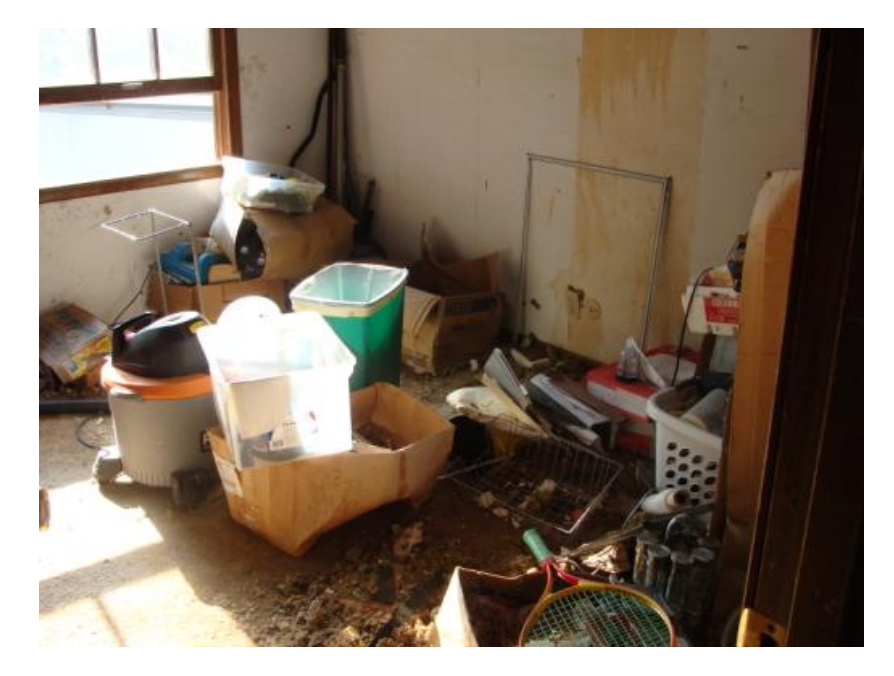
Electrical outlet – scorched: