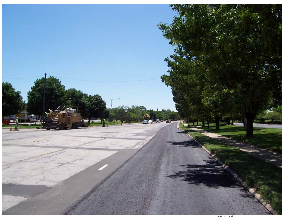
Description – During Contracted Microsurfacing on N 2<sup>nd</sup>/3<sup>rd</sup> St (Completed Asphalt Patching seen here also).