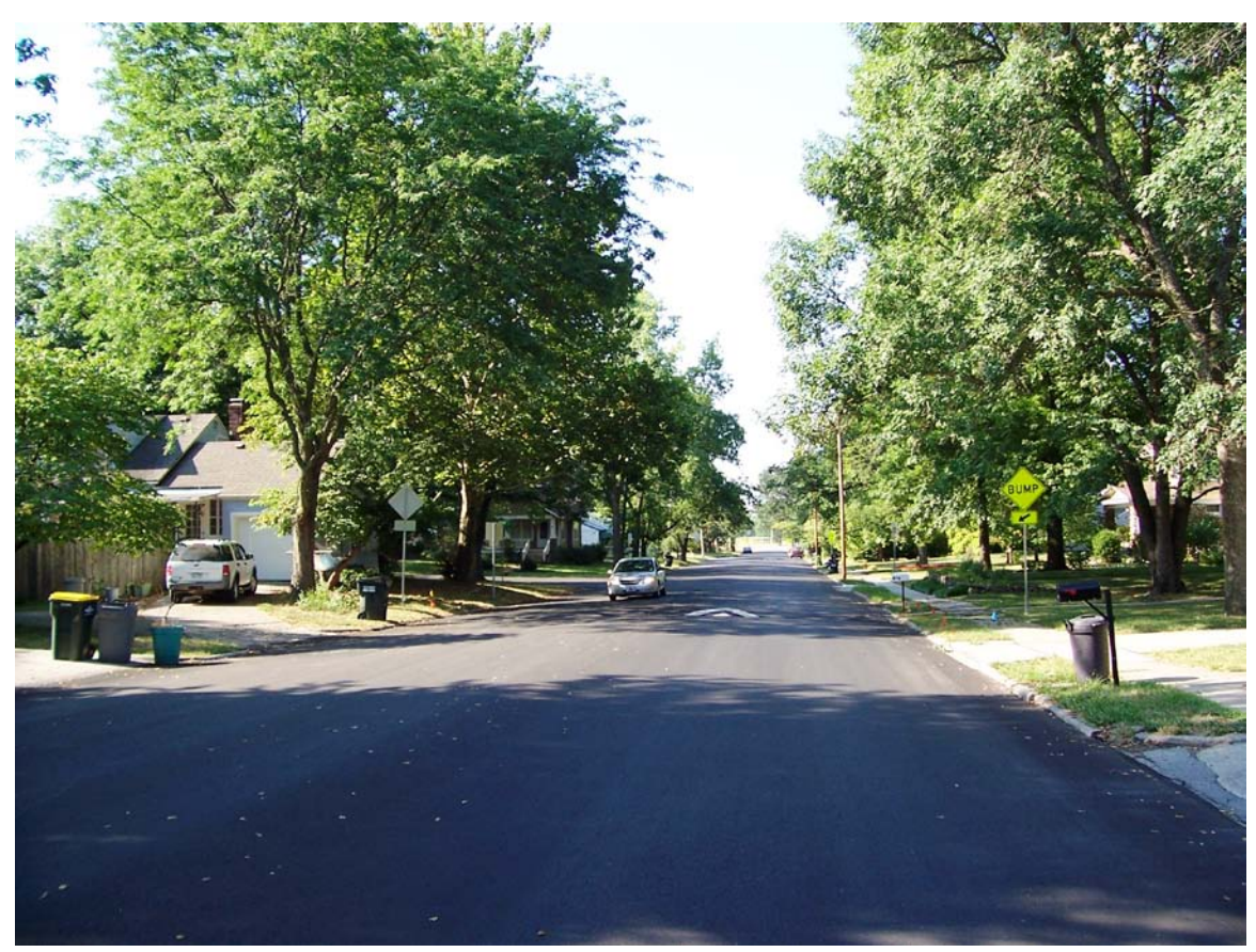
Description – Massachusetts St after completion of Contracted Asphalt Overlay (Installed Traffic Calming Asphalt Speed Humps seen here also).