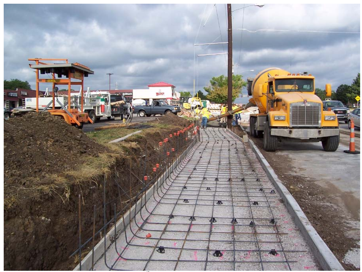
Description – KLINK- W 6<sup>th</sup> St at Kasold Dr during Contracted Concrete Sidewalk/Retaining Wall and Street Widening.