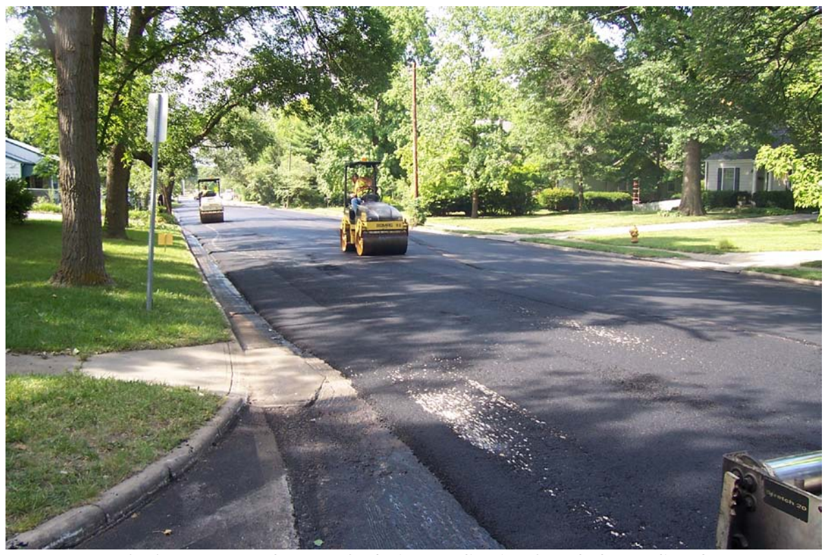
Description – Massachusetts St during applicatin of Asphalt Leveling Course as part of Contracted Asphalt Overlay.