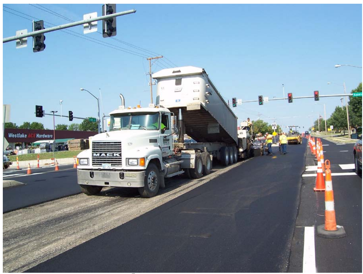
Description – KLINK- W 6<sup>th</sup> St at Kasold Dr during Contracted Asphalt Overlay.