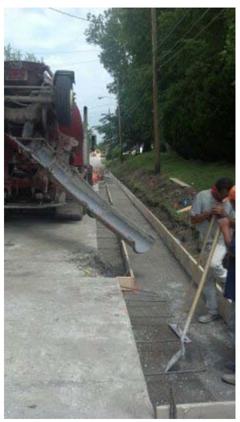
Description – During Contracted Concrete Patching & Curb Replacement on N 3<sup>rd</sup> St north of Maiden Ln.