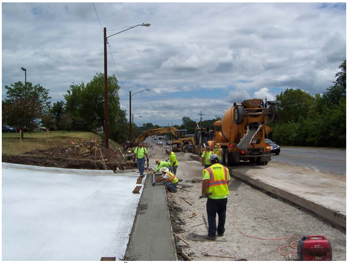
Description – KLINK- W 6<sup>th</sup> St during Contracted Concrete and Street Widening between Rockledge Rd and Iowa St.