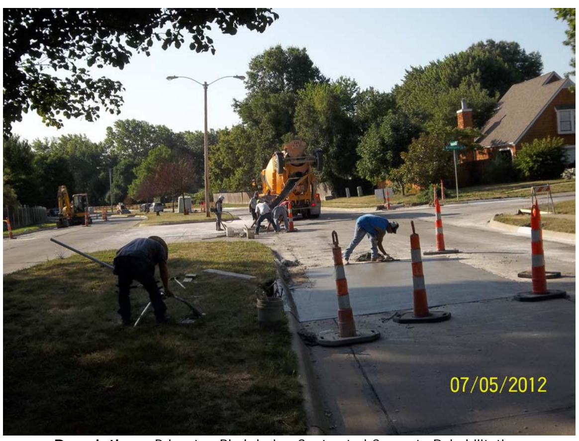
Description – Princeton Blvd during Contracted Concrete Rehabilitation.