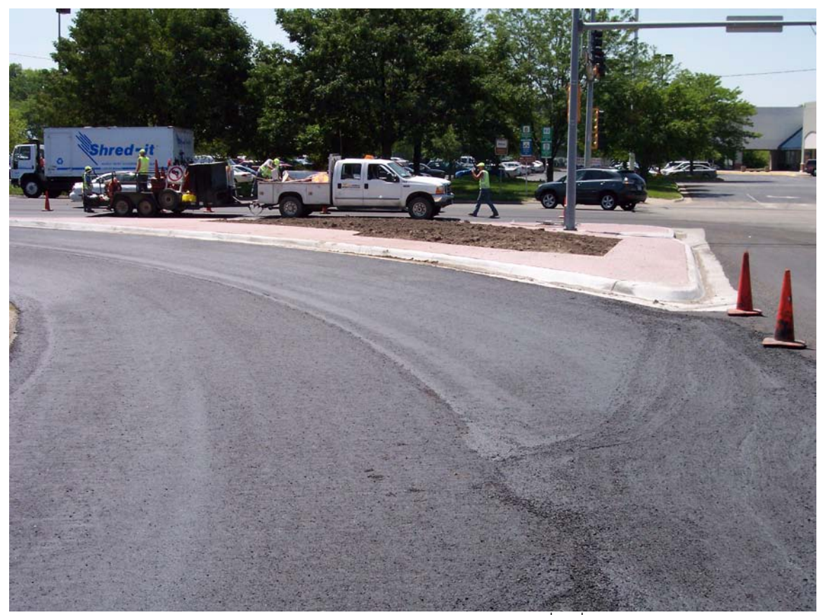
Description – During Contracted Microsurfacing on N 2<sup>nd</sup>/3<sup>rd</sup> St at KTA ramp access. (Internal Street Maintenance Division Concrete Reconstruction of median island seen here also).