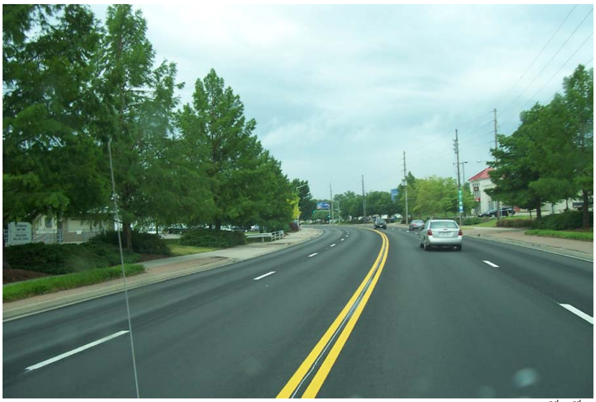
Description – Completed Contracted Microsurfacing w/ Pavement Markings on N 2<sup>nd</sup>/3<sup>rd</sup> St