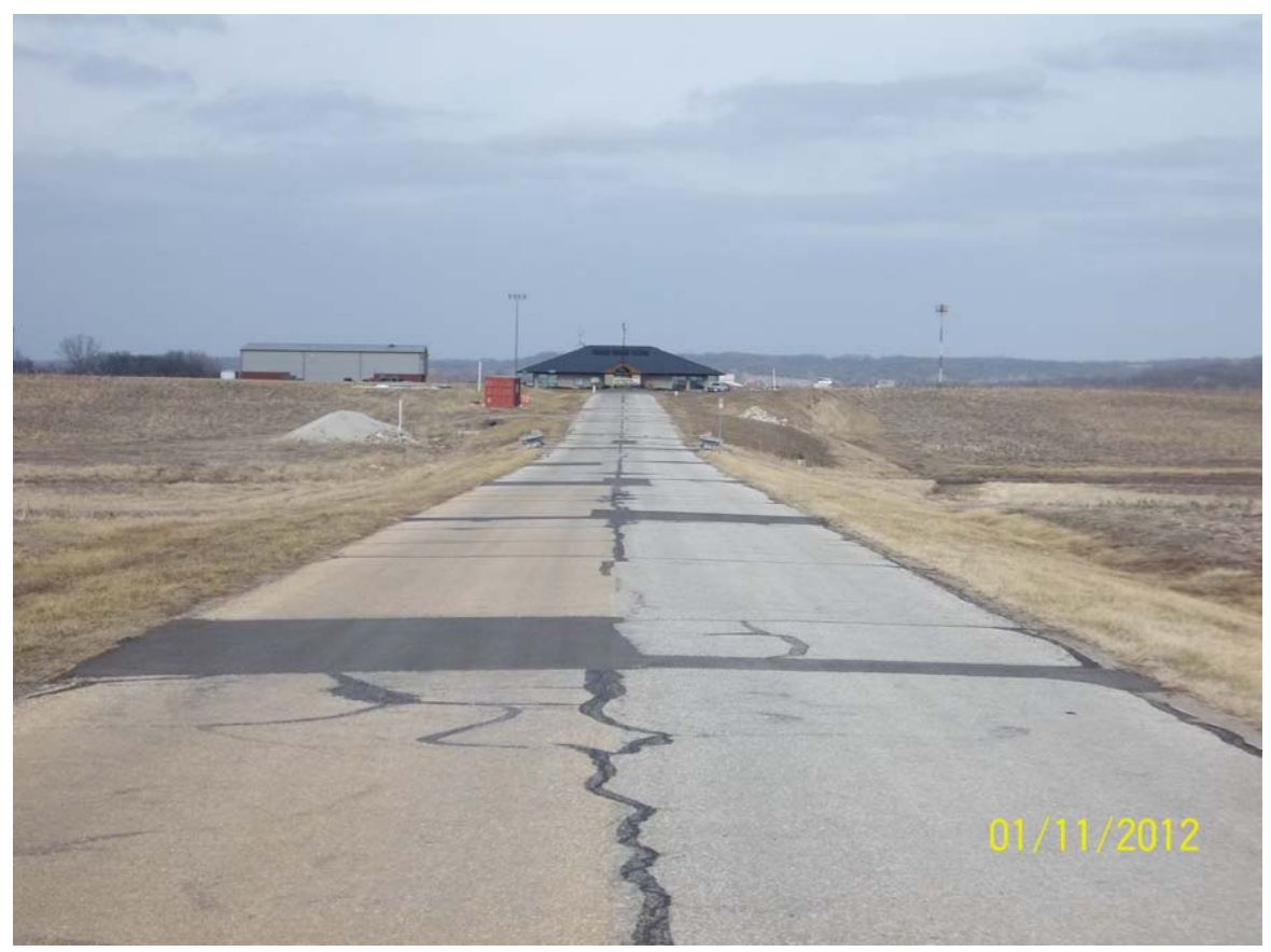
Description – Airport Rd prepared with Asphalt Patching prior to Contracted Microsurfacing.