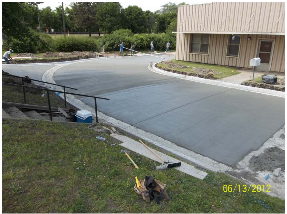
Description – Perry St at N 2<sup>nd</sup> St (frontage) during Contracted Concrete Rehabilitation/Reconstruction.