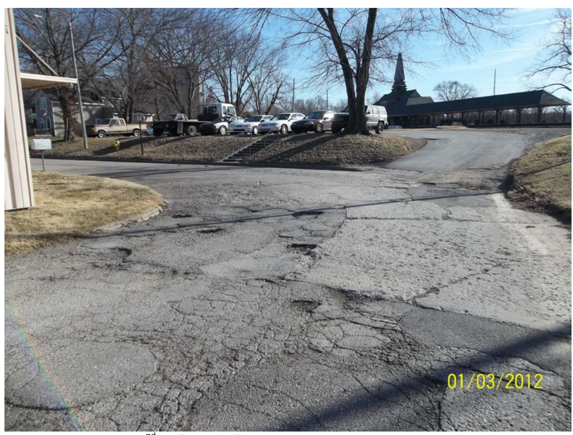
Description – Perry St at N 2<sup>nd</sup> St (frontage) prior to Contracted Concrete Rehabilitation/Reconstruction.