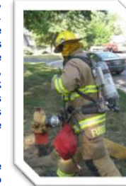
10/18/2011 Valor Public Safety Awards

The fire service has entered into a very competitive evolutionary cycle. Public demands continue to increase, while dollars and other resources continue to shrink. These trends place increased pressure on the modern fire service manager, policymakers, and staff to develop ways to be more effective and more efficient. In many cases, the public is demanding the accomplishment of specific goals, objectives, and services with fewer resources. To work more efficiently with available resources, organizations must establish their direction based on constructive efforts while eliminating programs that do not serve the community.