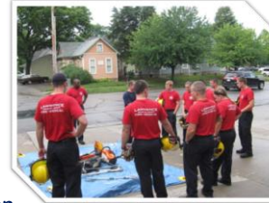
8/19/2011 Busiest Day of 2011

Fifty-two (52) incidents on this day, which is twice our normal call level.