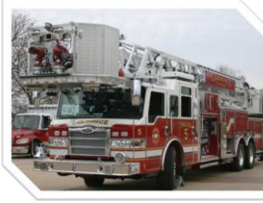
4/16/2011 2011 Pierce Truck 5 – placed in service