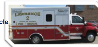
7/27/2011 ISO Rating

The City of Lawrence participated in a Public Protection Classification survey conducted by the Insurance Services Office (ISO) from December 14 through December 16, 2010.