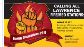
5/31/2011 - 9/30/2011 Energy Smackdown

The department's stations entered into an "Energy Smackdown" against each other to help the City of Lawrence battle against the City of Manhattan in the "Take Charge Challenge", a competition to help spark energy-conservation efforts. Manhattan ultimately won that contest, but the department trimmed more than $1,500 from its electric bill during the four-month period. Station 2, 2128 Harper St. ended up winning the "Energy Smackdown" with an overall savings of 20 percent.