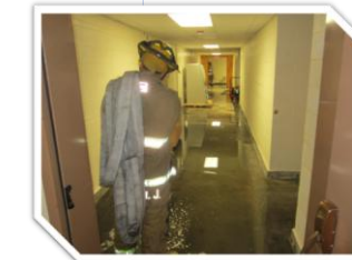
9/27/2011 - 9/29/2011 Community-Driven Strategic Plan

On November 26, 2011, Lawrence-Douglas County Fire Medical responded to a three alarm structure fire in a laboratory on the 5th floor of Malott Hall on the University of Kansas campus. The fire caused an estimated $1.1 million in damages to the property and contents.