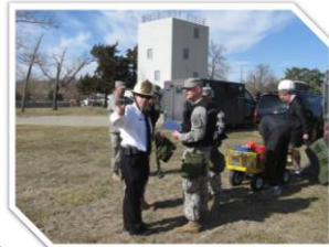
2/16/2011 Hazmat Exercise with 73rd Civil Support Team

In February, Lawrence-Douglas County Fire Medical conducted three days of hazardous materials training with the Kansas National Guards 73rd Civil Support Team (CST) at the vacated Farmland site. The series of drills and full scale exercise were conducted to increase the interpretability of the CST and Fire Medical. Department members received training over Potassium Cyanide, KCN lab, exploding Radiological Dispersal Device (RDD), ecstasy lab, Hydrogen Sulfide suicide and a Ricin lab.