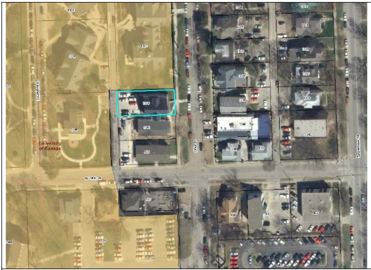
Figure 2. Aerial photo of 1339 Ohio, outlined in blue, and surrounding area.