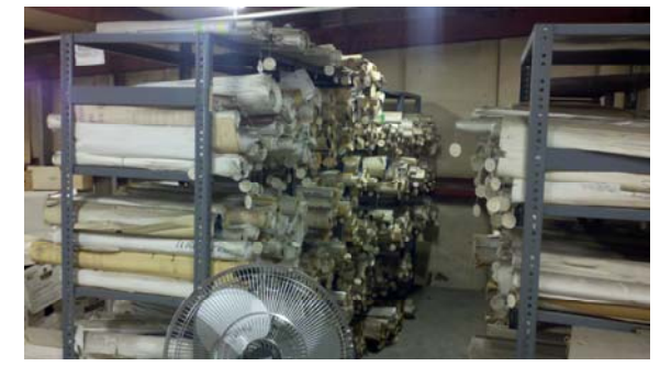
Building plans in storage at SWAN