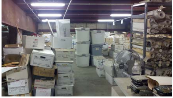
Before: SWAN mezzanine, facing south

The project required coordination with various city departments to organize, label, and repack (as necessary) boxes of records to be stored at a private records management and storage facility. In total, 9,283 pounds of records beyond their retention dates were securely shredded, and 1,289 cubic feet of boxed records plus 165 rolled building plans were transferred to the storage facility. The private facility offers cleanliness, organization, security and ease of document retrieval that could not be duplicated in-house without great expense. Photos of the project are below.