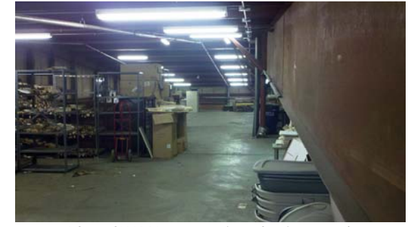
After: SWAN mezzanine, facing north