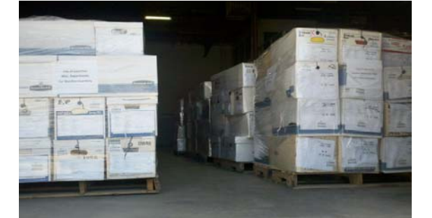
Palletized boxes to be shipped to storage