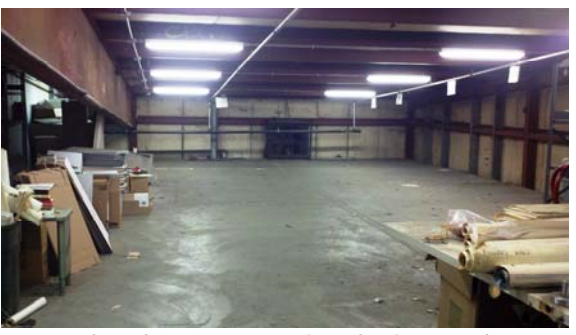
After: SWAN mezzanine, facing south