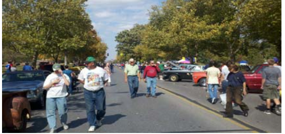
Pedestrians peruse the muscle cars at the Hot Rod Hullaballoo on Massachusetts Street in South Park. Such events often require City Commission approval and support from numerous departments including Public Works, Parks and Recreation, Police and Fire Medical.

In 1991, the issuance of temporary use of rightof-way permits became an administrative process and 16 permits were issued.