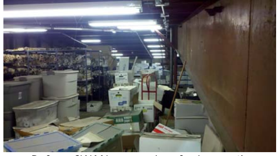
Before: SWAN mezzanine, facing north