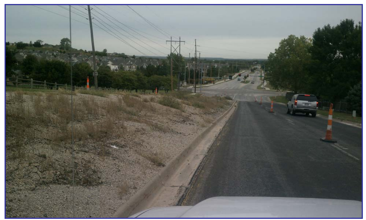
Kasold - North bound at Peterson