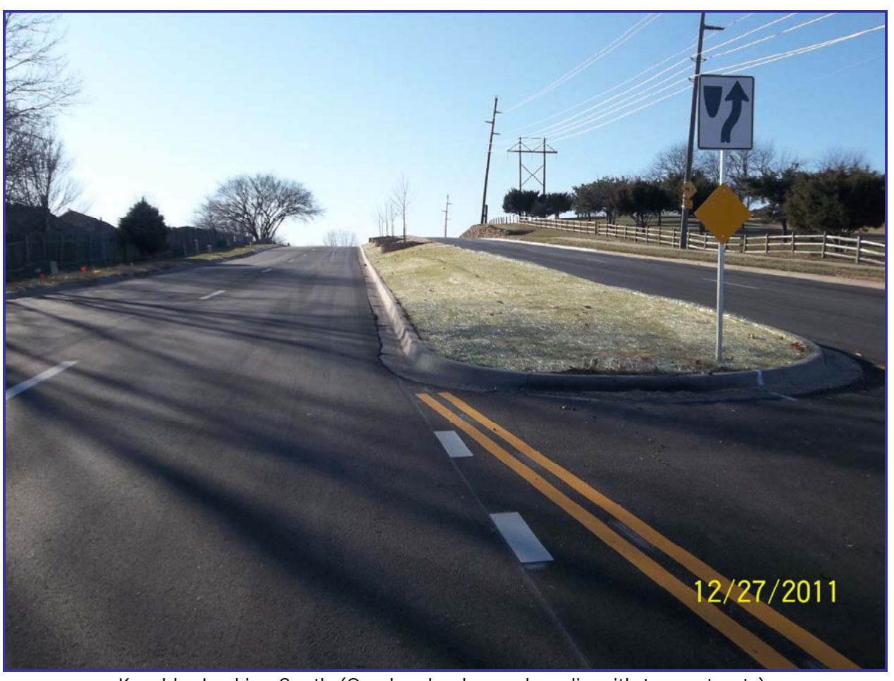
Kasold – Looking South (Overlay, landscaped media with tree cut outs)