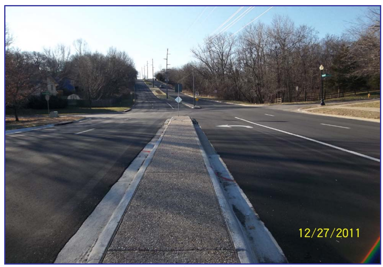
Kasold – Looking North (exposed aggregate median)