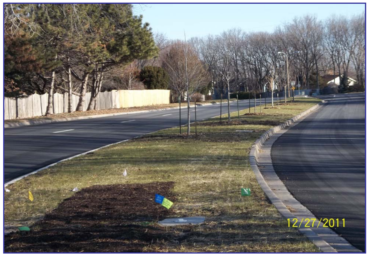
Kasold -Looking North (landscaped median, new curbs with overlay)