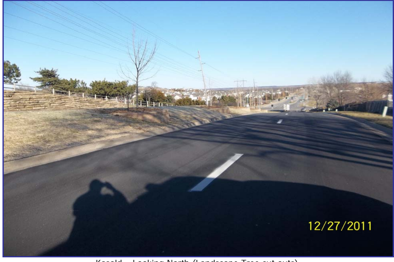
Kasold – Looking North (Landscape Tree cut outs)