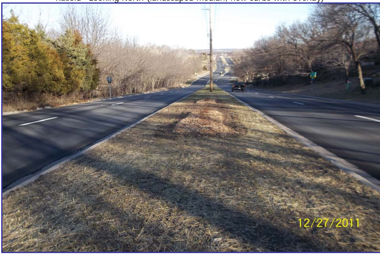
Kasold -Looking North (landscaped median, new curbs with overlay)