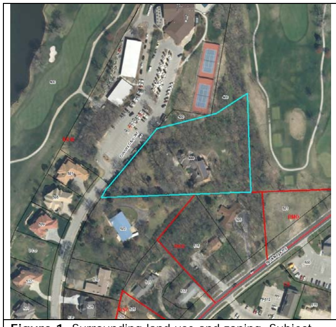
Figure 1. Surrounding land use and zoning. Subject property outlined in blue.

RSO (Single-Dwelling Residential-Office) District 2 lots south of the subject property; detached dwellings.