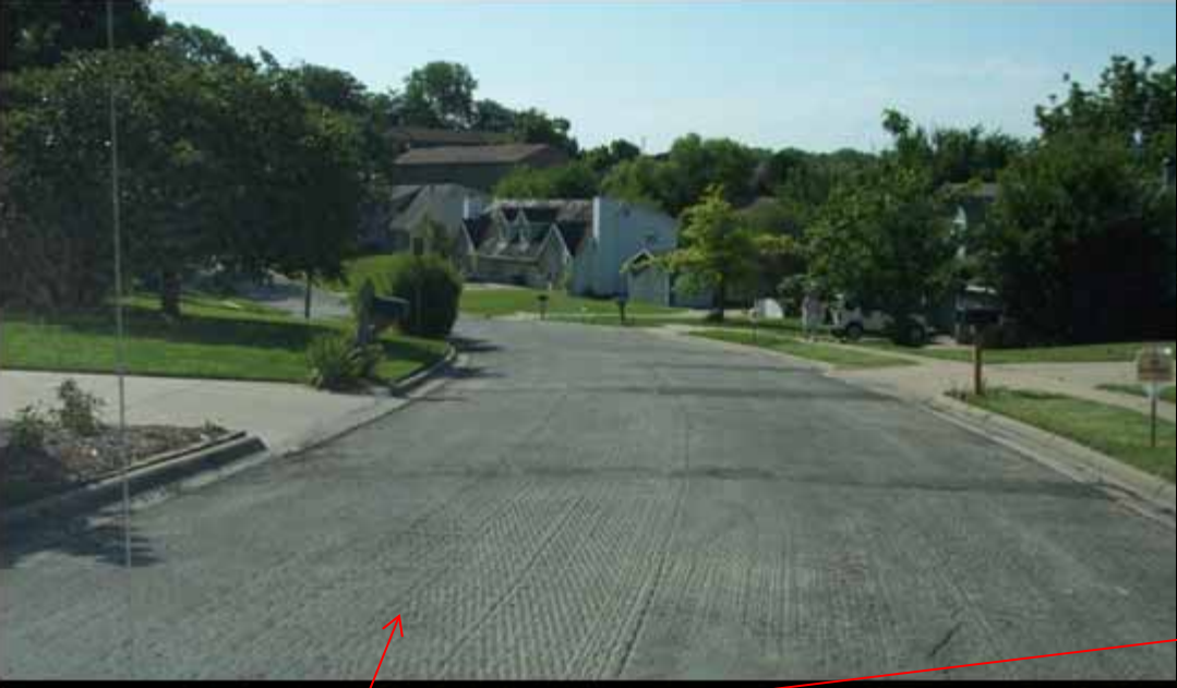
Oxford Rd. and Cr.