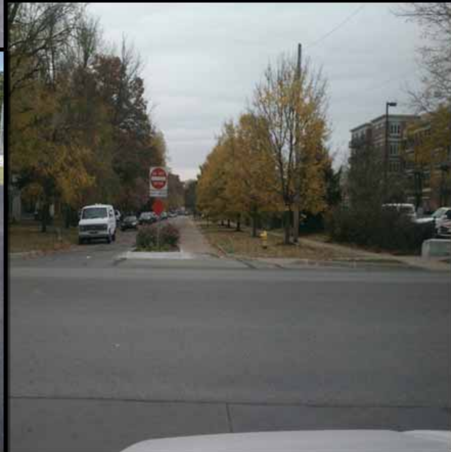
7th and Rhode Island median