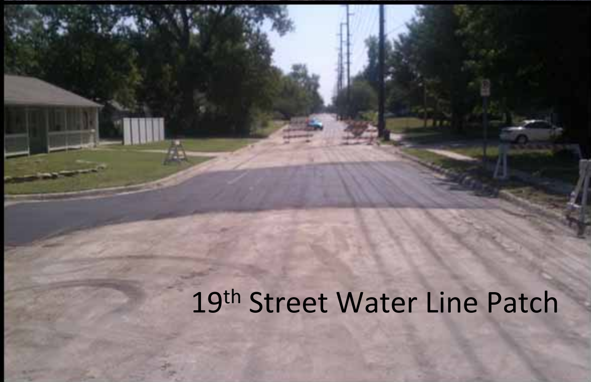
19 th Street Water Line Patch