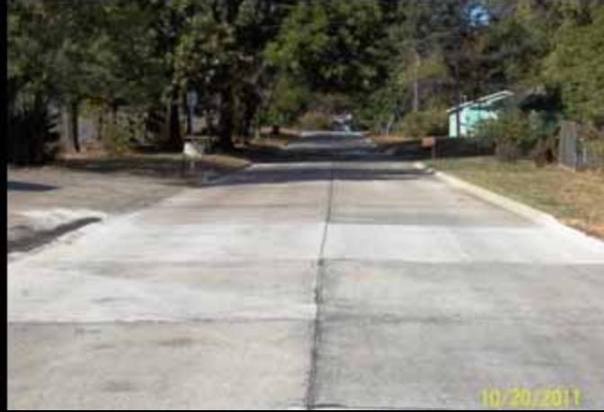
Delaware and E 22 nd Ter.