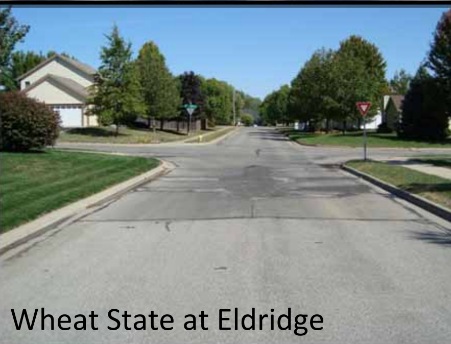
Wheat State at Eldridge