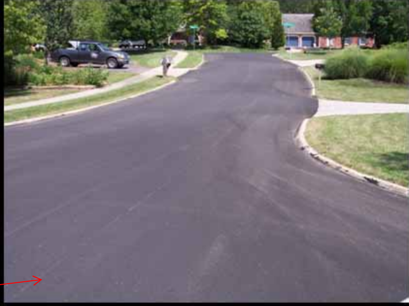
Forrest Ave. and Maryland