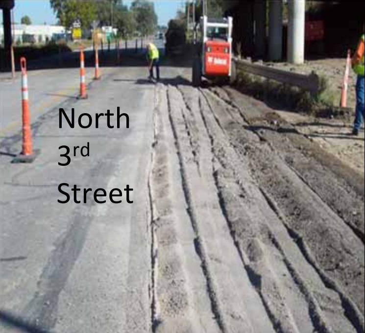
North 3 rd Street