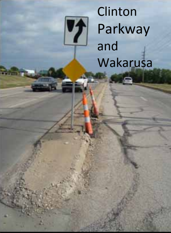
Clinton Parkway and Wakarusa