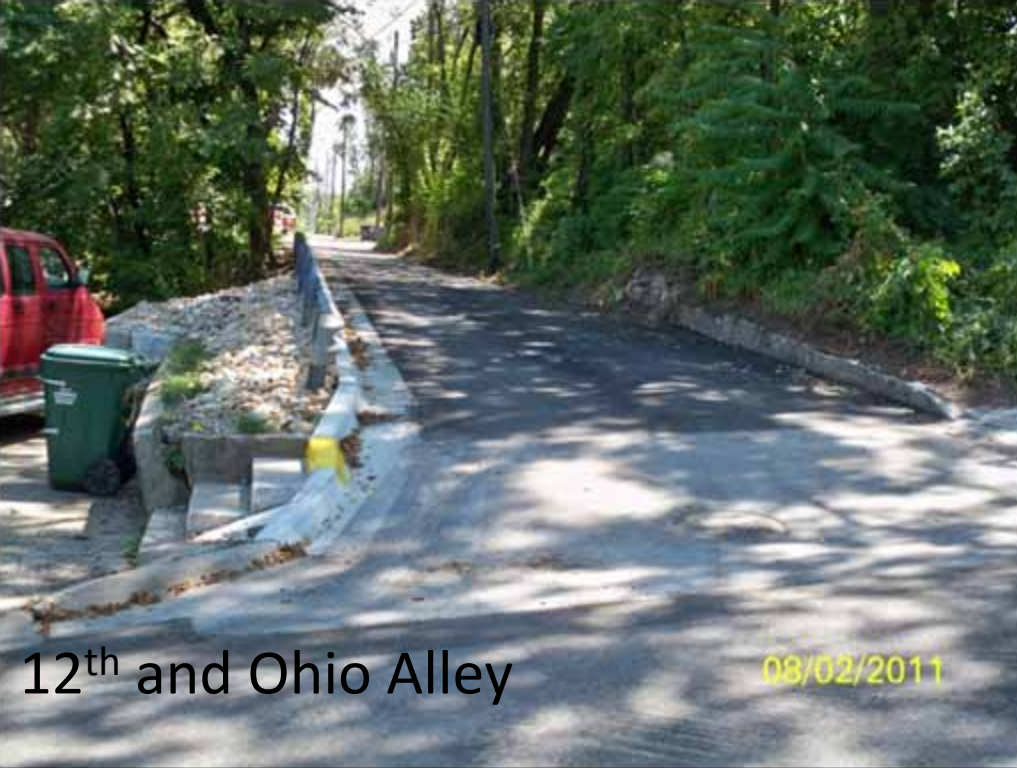
12 th and Ohio Alley