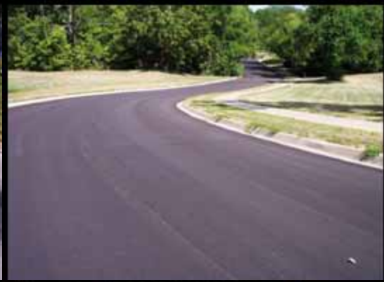
Quail Creek Drive