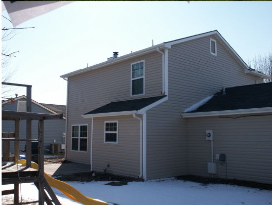
Before (above) & After (below) photo of a home re-sided through the Comprehensive Housing Rehabilitation Program