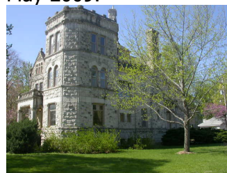
The Castle Tea Room (John N. Roberts House), 1307 Massachusetts St.

Historic Resources staff worked with the Libuse Kriz-Fiorito Historical Foundation and the Kansas State Historic Preservation Office on the rehabilitation of the John N. Roberts House also known as the Castle Tea Room. In addition to restoration of the woodwork & the stained glass windows, the rehabilitation includes the reconstruction of a fountain in the front yard and the installation of a geothermal heating and cooling system. The "Castle" will be used as a special event venue and is scheduled to open in May 2009.